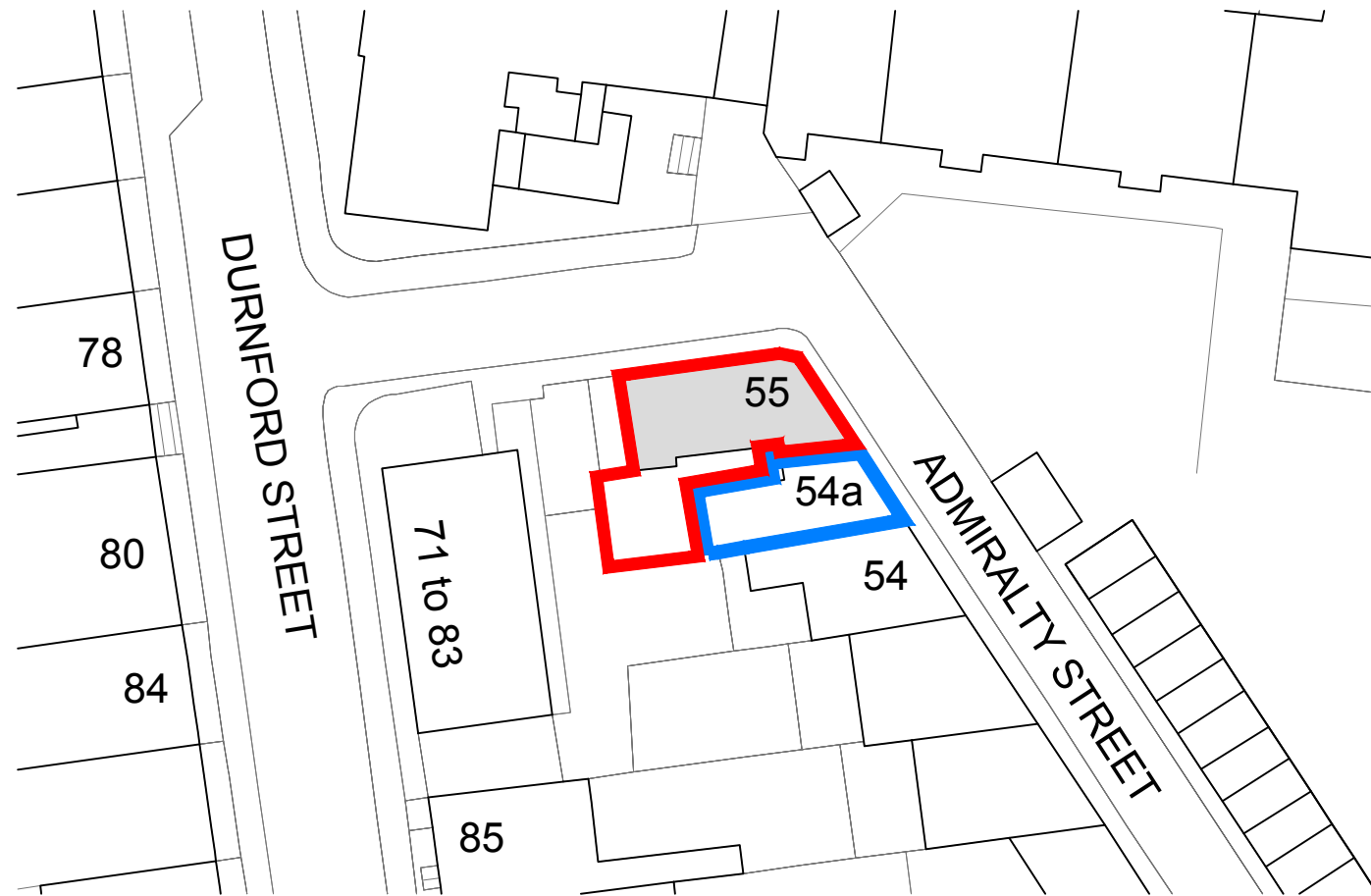
Site Block Plan Scale 1:500