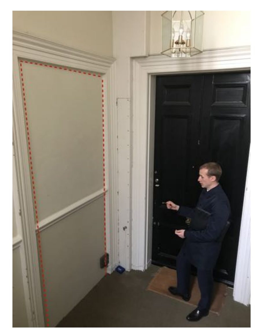
IMAGE 01 - BUILDING N.42 RED DOTTED LINE ON PICTURE INDICATING NEW ENTRANCE DOOR TO FLAT 1 EXISTING ENTRANCE DOOR (BLACK PAINTED) TO BE KEPT IN