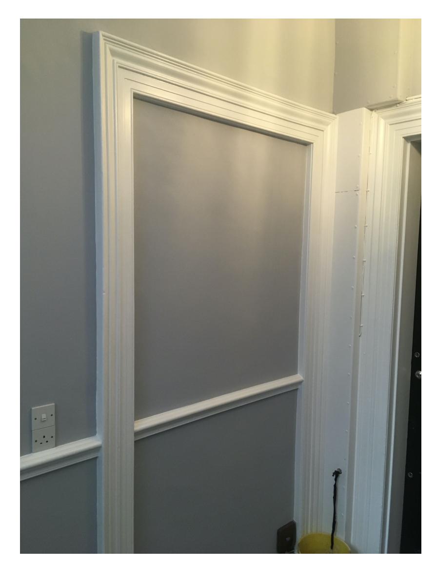
IMAGE 02 - BUILDING N.42 IMAGE SHOWING POSITION OF NEW ENTRANCE DOOR. THE NEW DOOR SEES THE RE OPENING AN EXITING OLD BLOCKED DOOR. EXISTING ARCHITRAVE TO BE KEPT IN SITU.