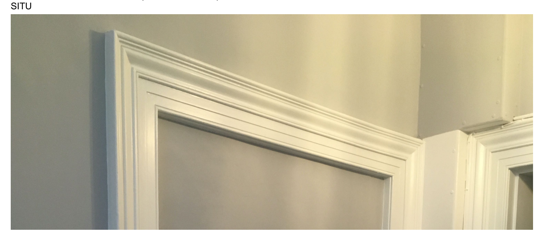
IMAGE 04 - BUILDING N.42 DETAIL OF EXISTING ARCHITRAVE TO BE KEPT IN SITU.