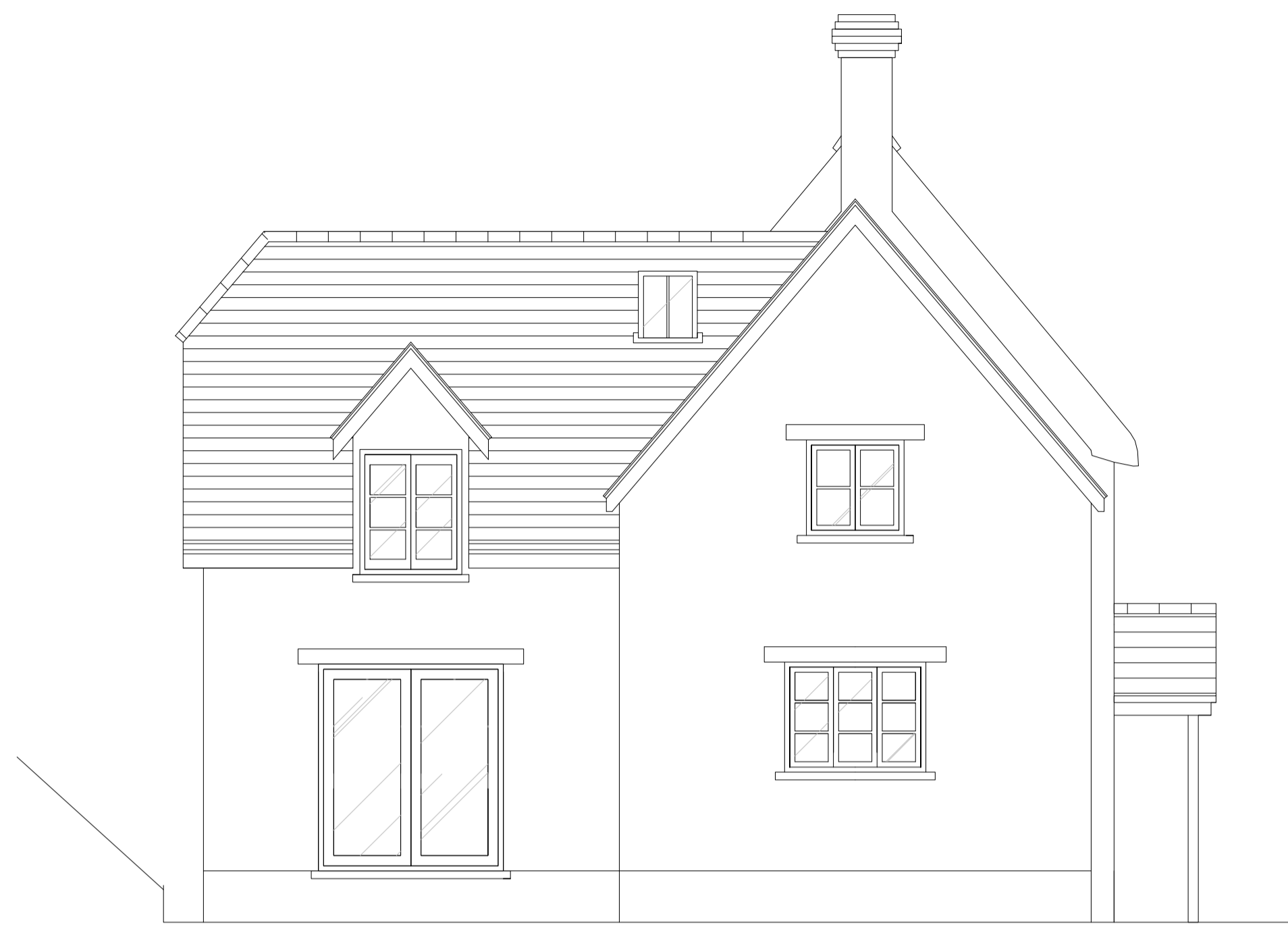
EXISTING WEST ELEVATION SCALE 1:50