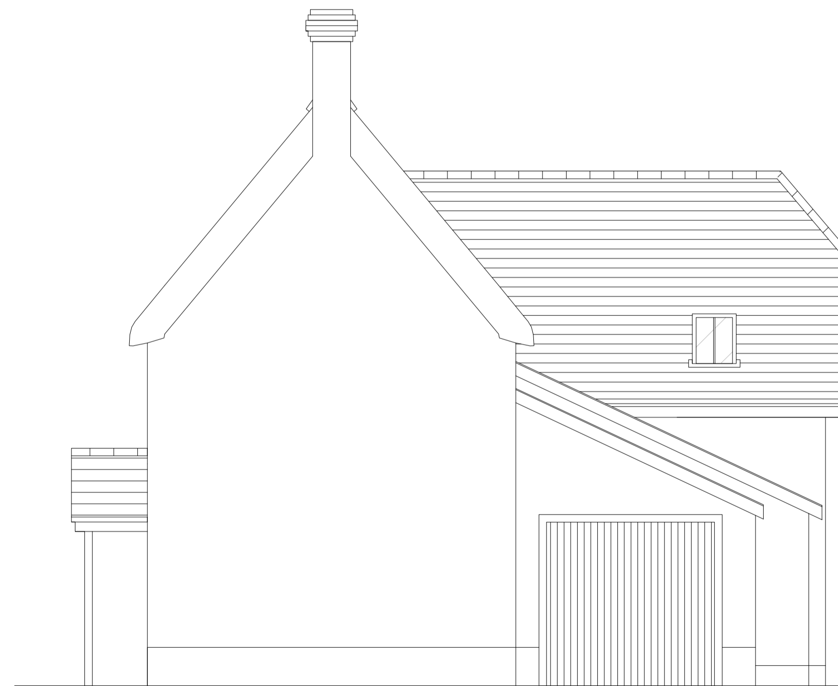
EXISTING EAST ELEVATION SCALE 1:50