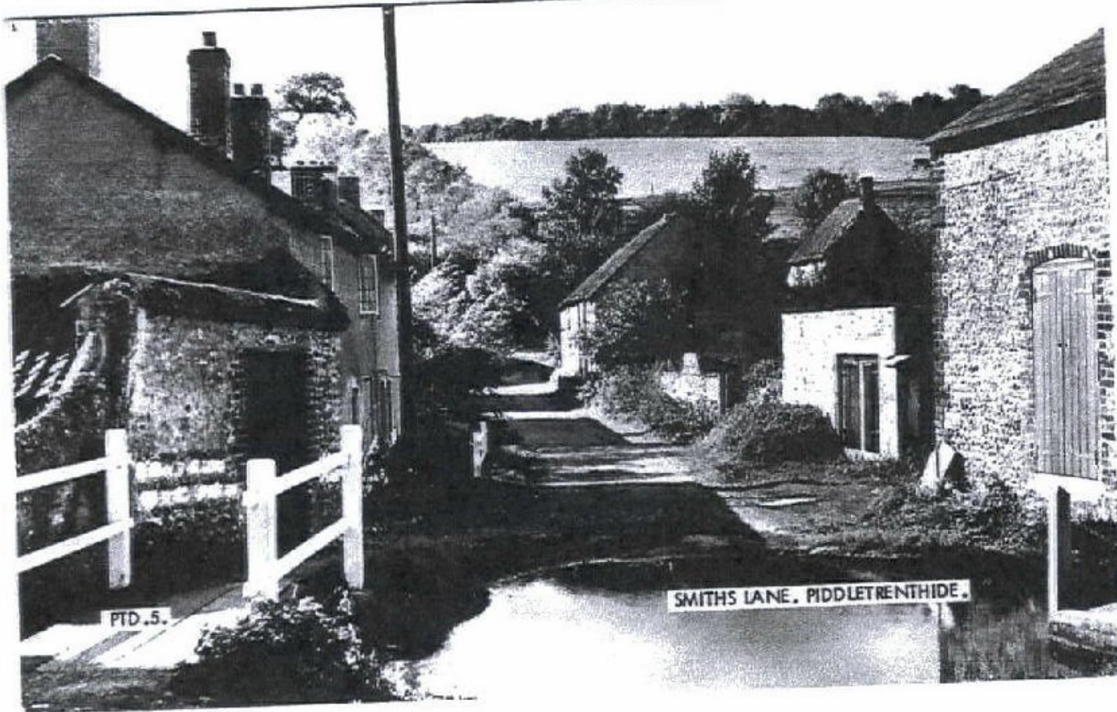
3. HISTORICAL PHOTOGRAPH OF SMITHS LANE LOOKING WEST.