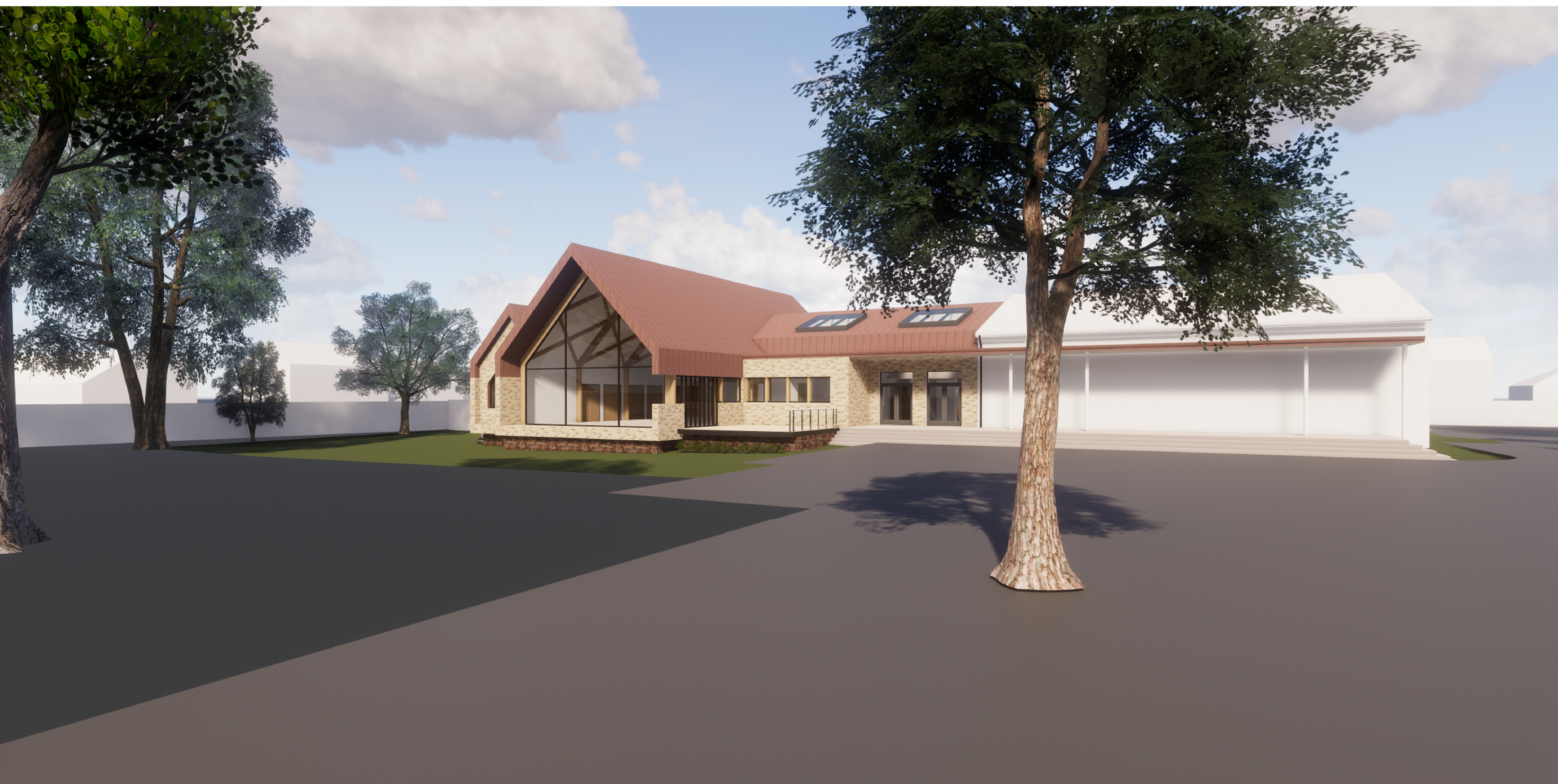
Eye view from parking space