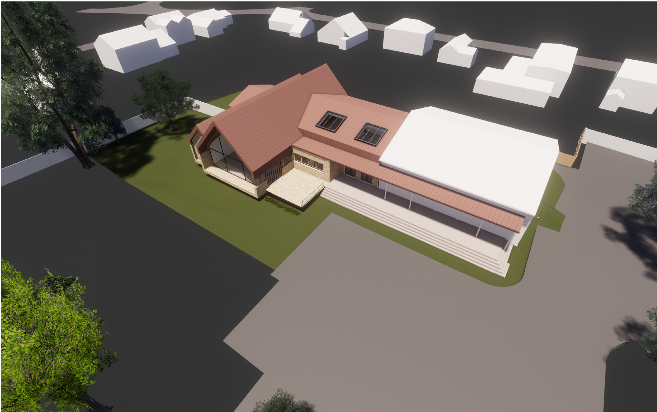
Aerial View - South East