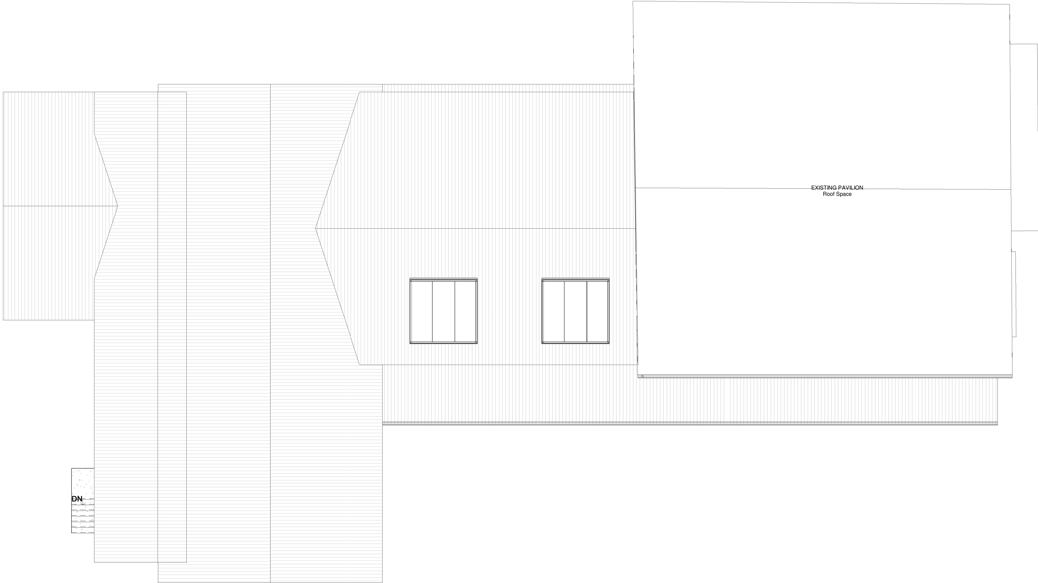
Roof Plan 1 : 100