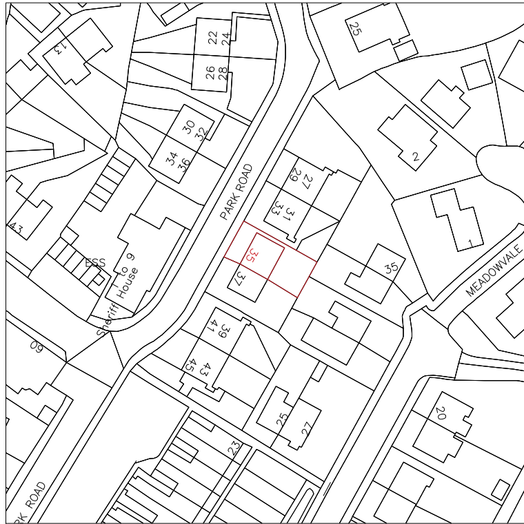
OS MAP - SCALE 1:1250