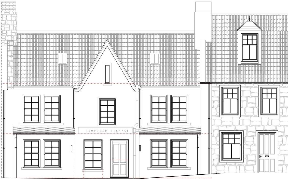
south east elevation