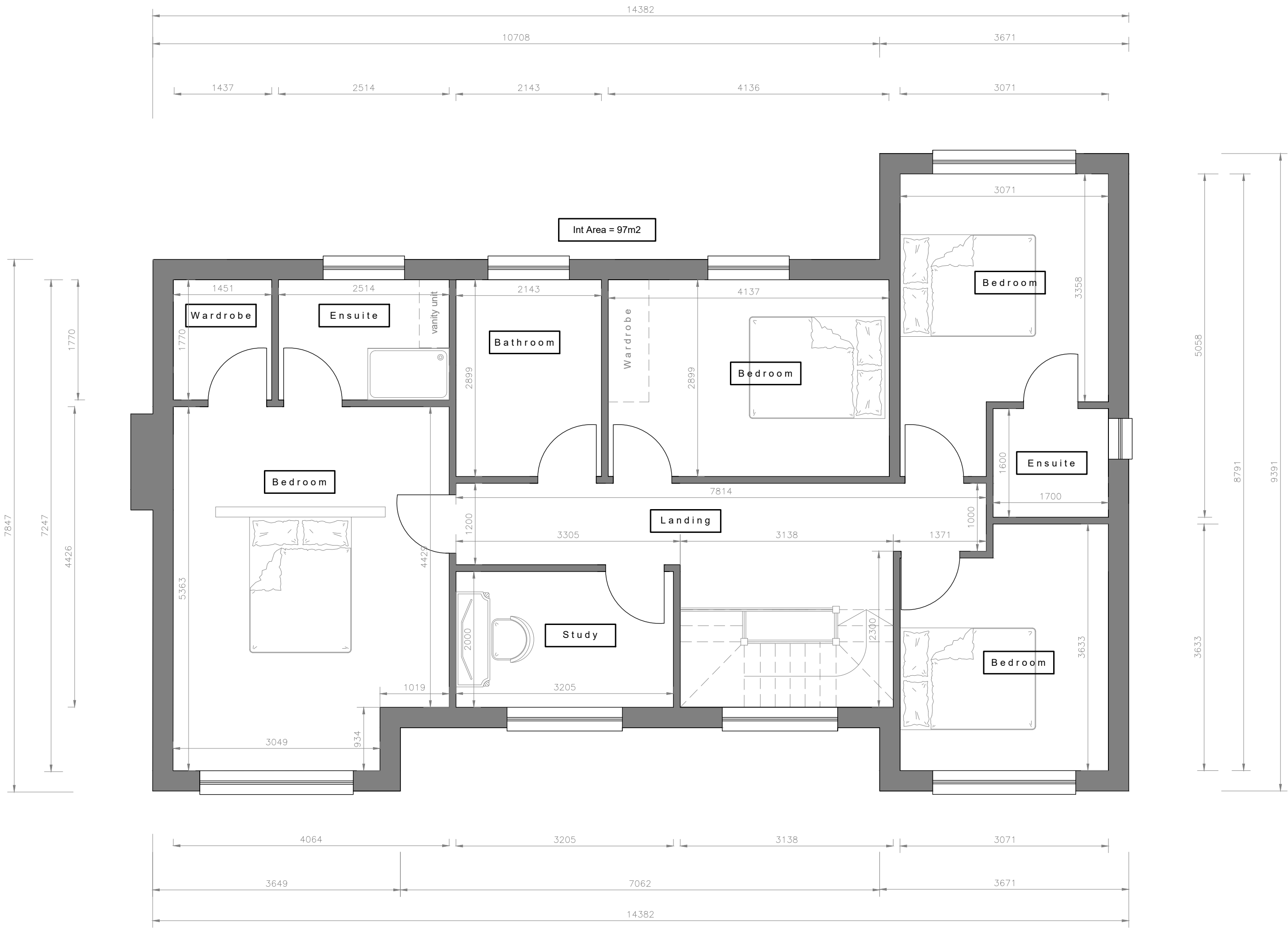
1 Proposed First Floor Plan 1:50