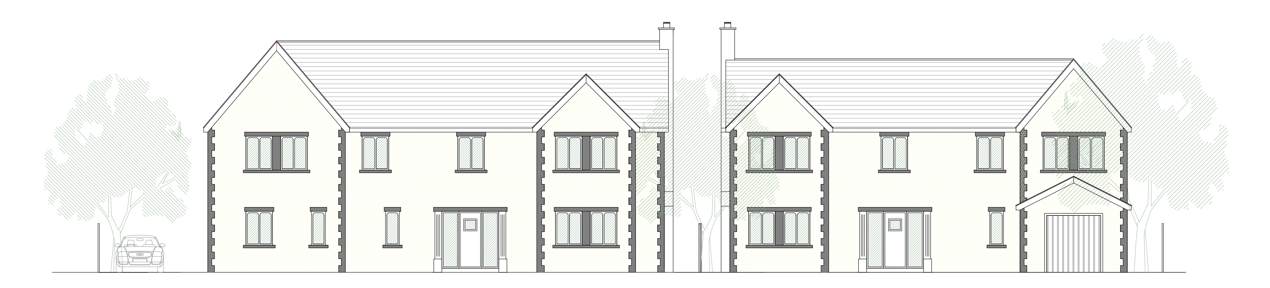
Proposed Street Scene 1:50