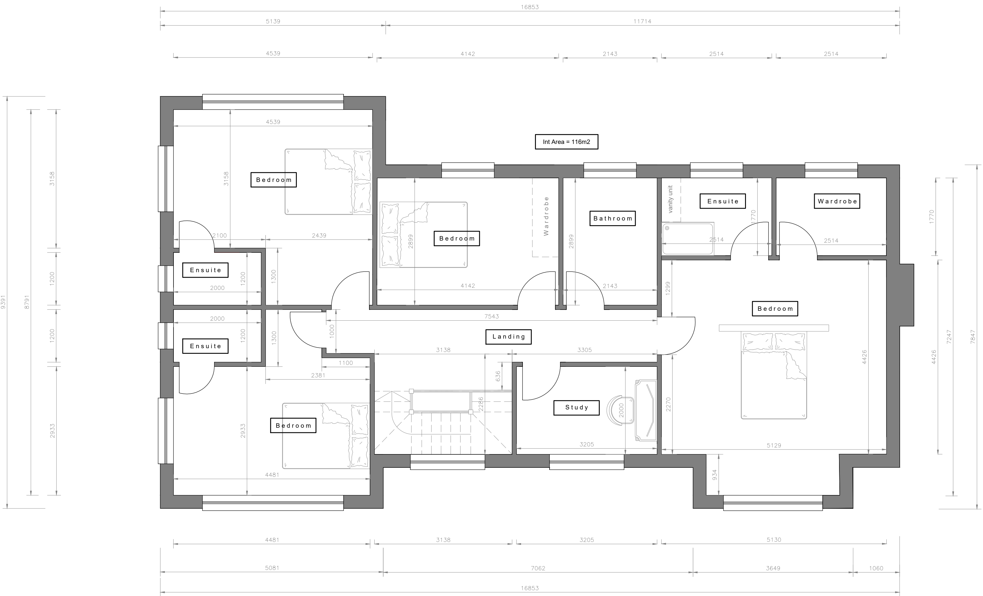
1 Proposed First Floor Plan 1:50