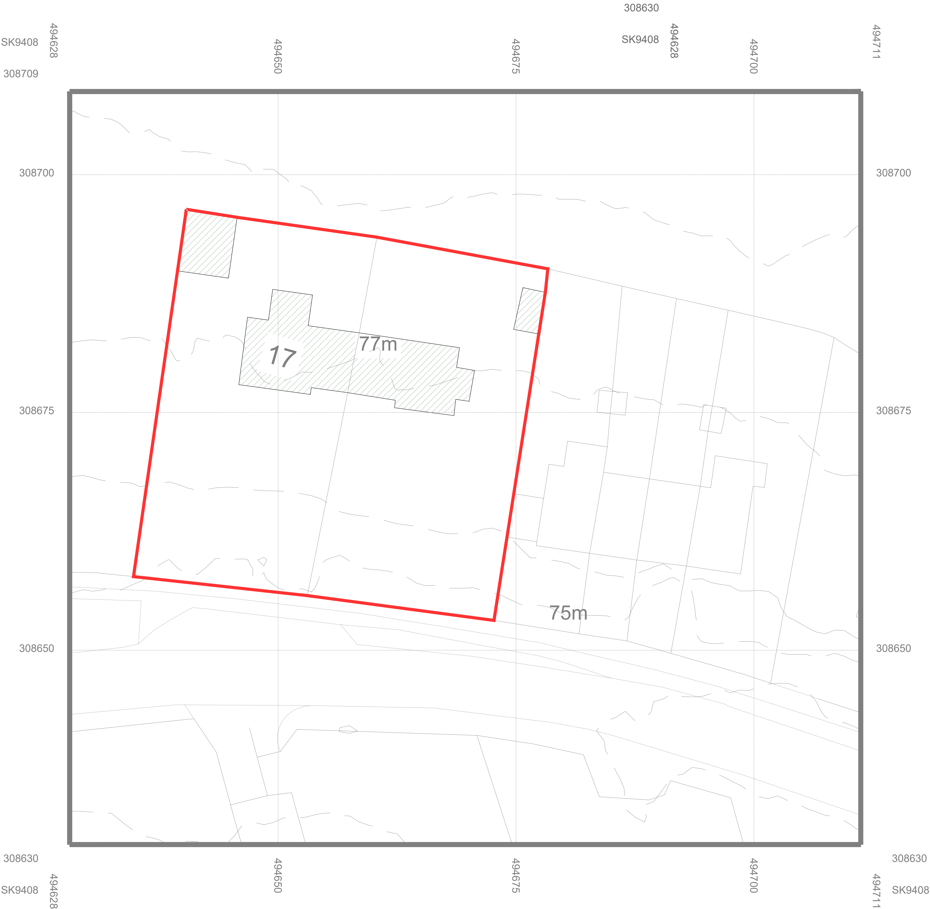
1 Existing Site Plan 1:200