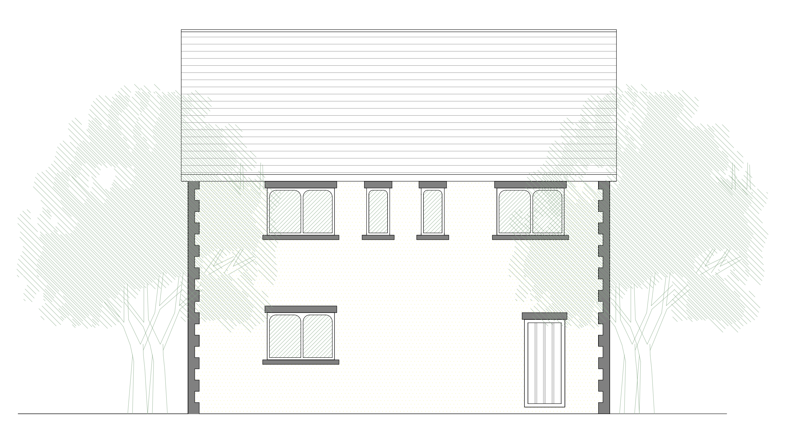
2^{\frac{\text{Proposed Side Elevation}}{1:50}}