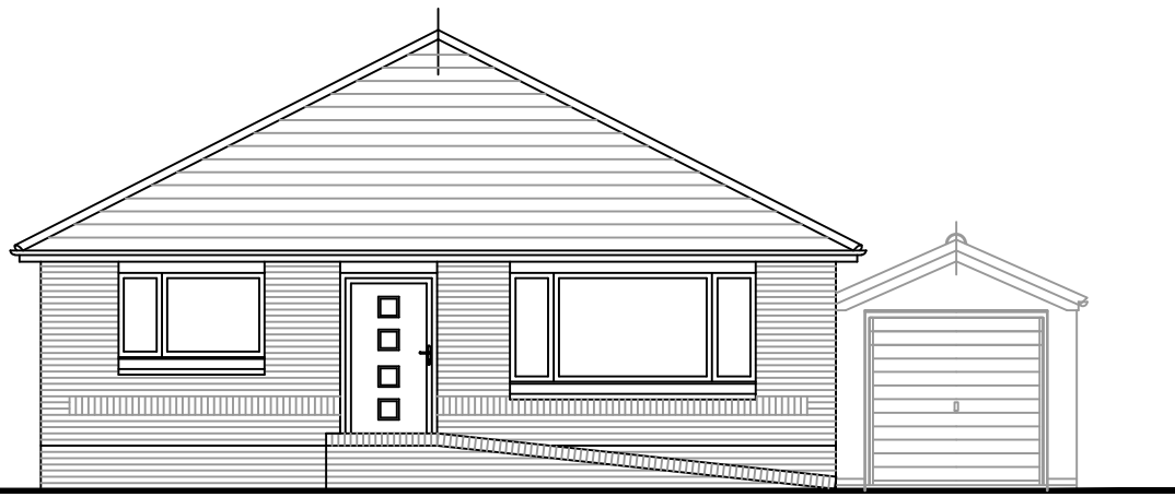
FRONT ELEVATION EXISTING