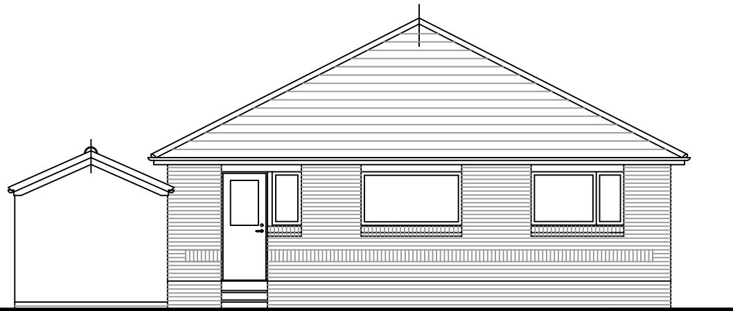
REAR ELEVATION EXISTING