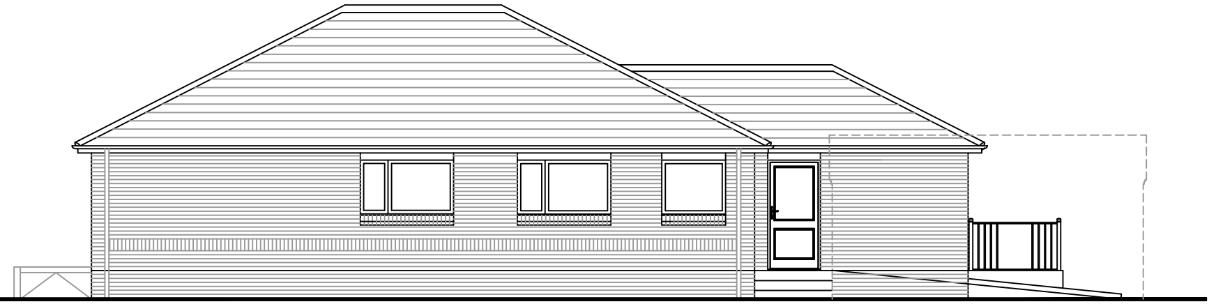
SIDE ELEVATION PROPOSED