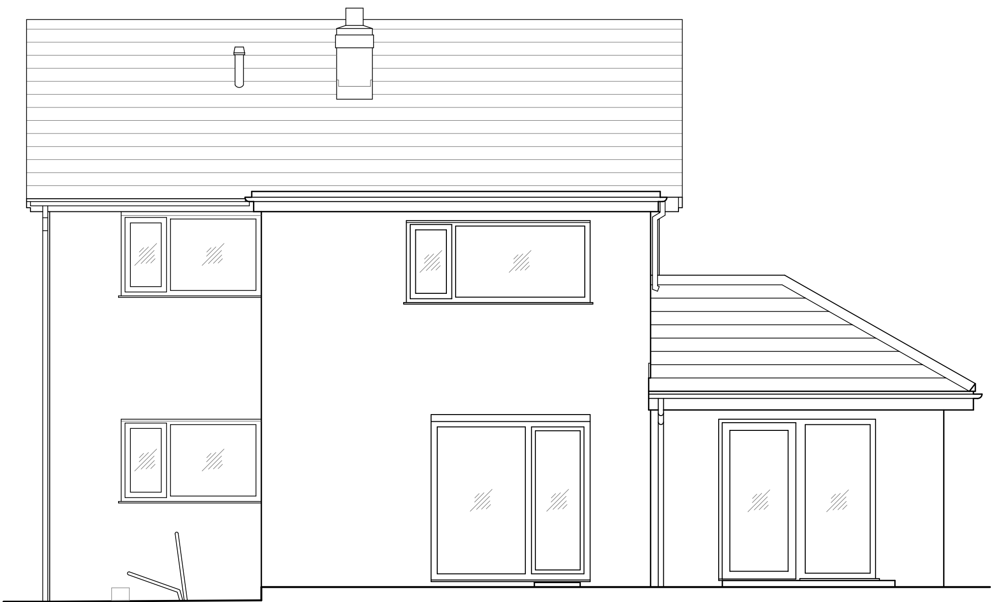
REAR (NORTH WEST FACING) ELEVATION Existing