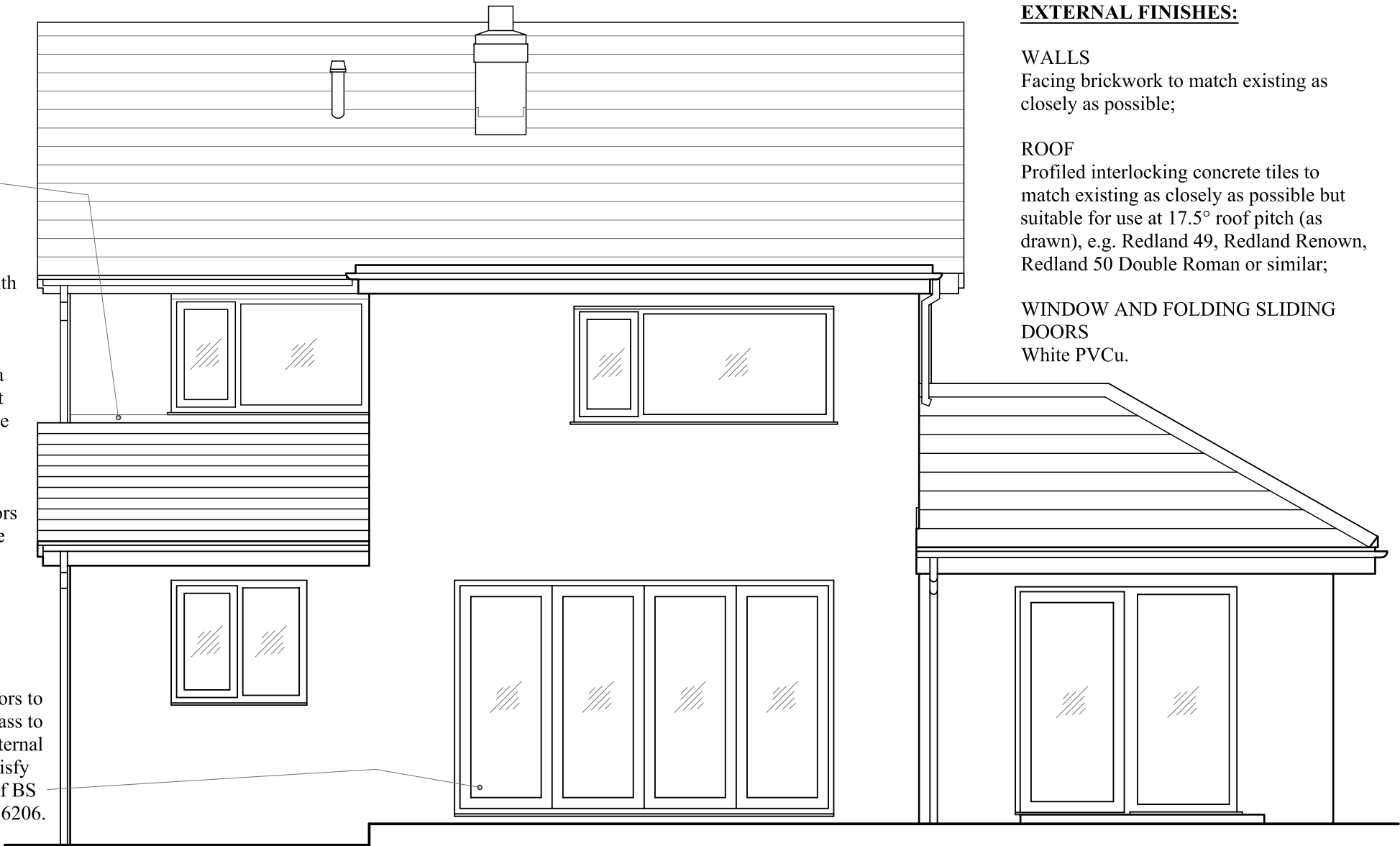
REAR (NORTH WEST FACING) ELEVATION Proposed