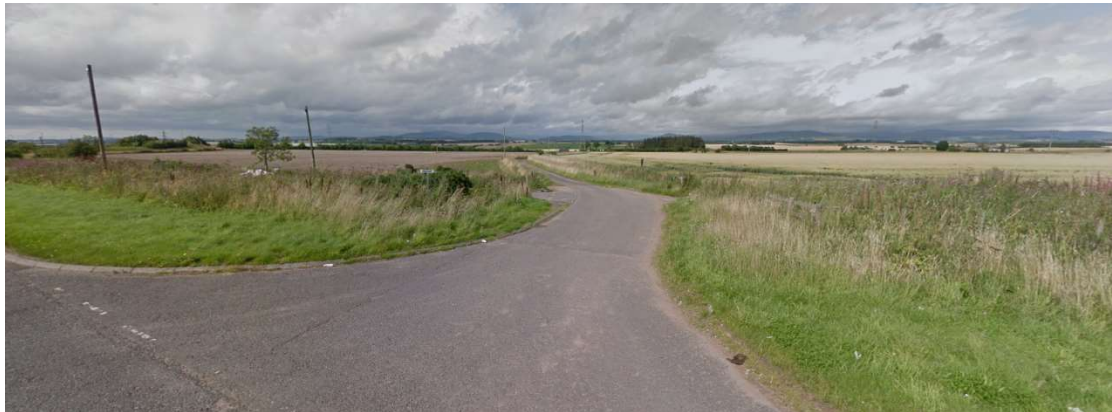
Road access to the site