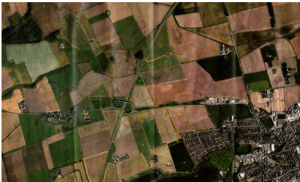
Farm map showing land holding.

The building has been located halfway down the access road for security purposes, this location will also make use of the tarred road when having crop delivered or collected. The short distance to the A90 will be very beneficial for the movement of goods. The proposed new buildings will be more secure and fit for purpose than the sheds that our client currently rents, and have been designed to be fit for future business security and growth. The earth bund surrounding the sheds will add screening from the A90 for security and lessen the visual impact.