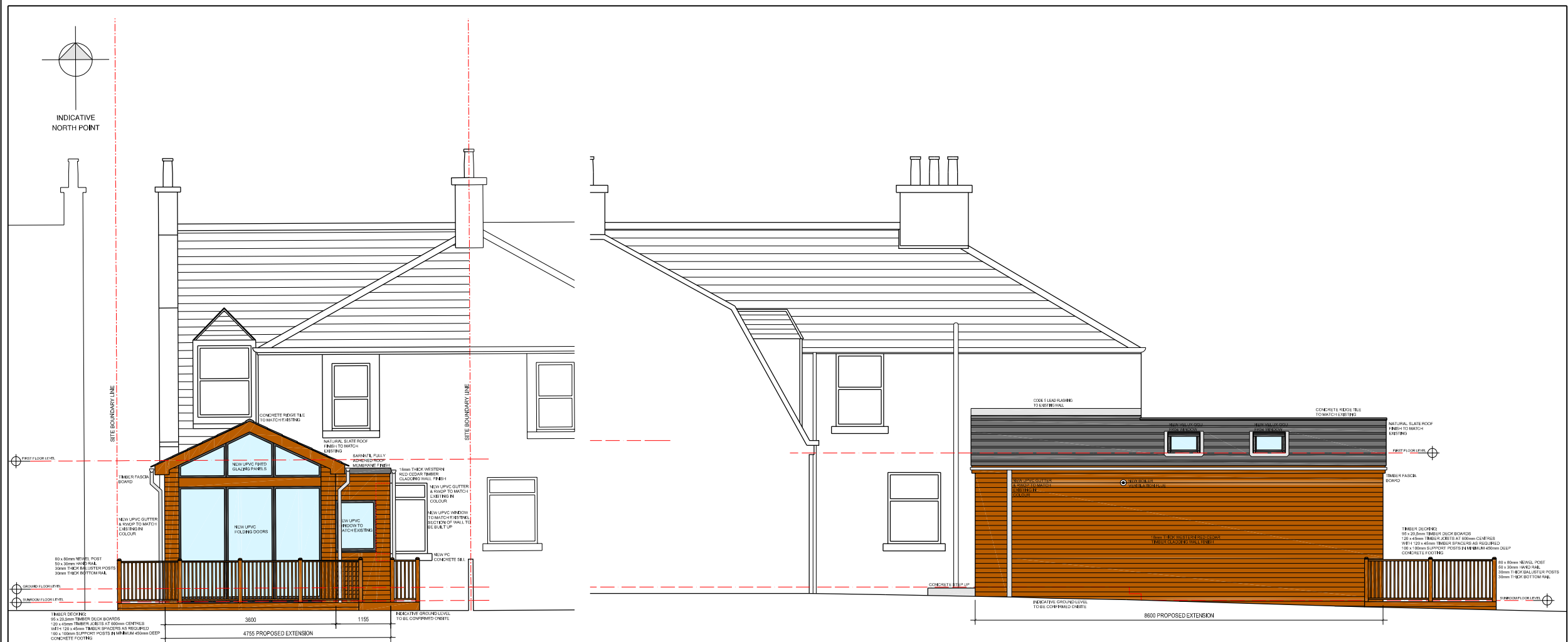
PROPOSED NORTH ELEVATION SCALE 1:100