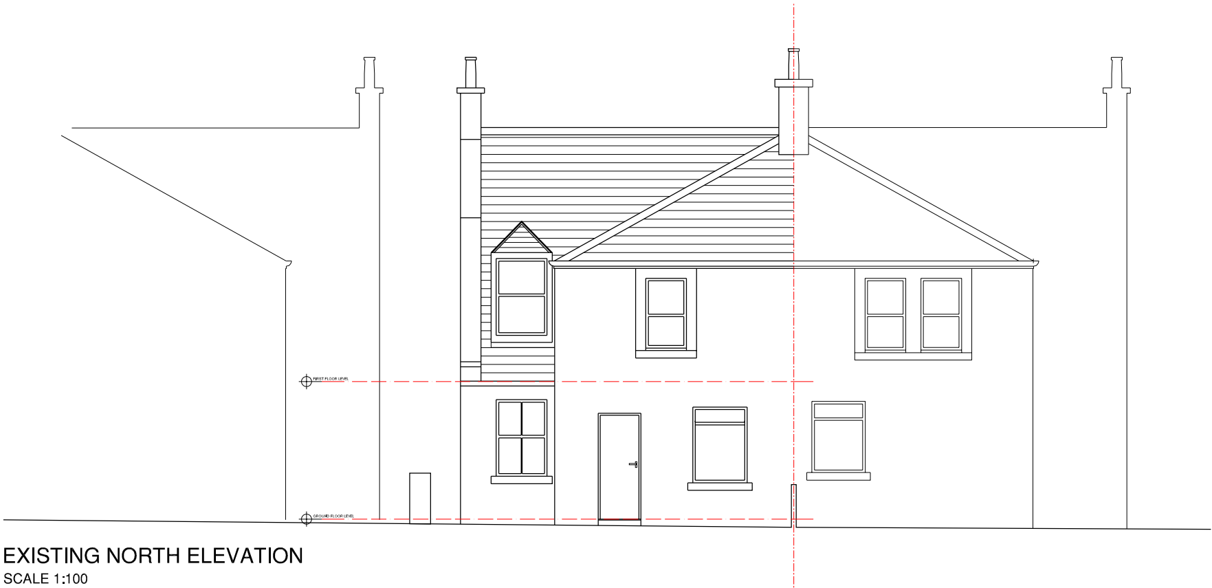
EXISTING NORTH ELEVATION SCALE 1:100