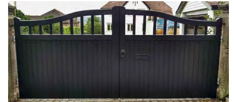
Sliding Swan Neck Gate with open lattice topping Max height of gate 1.1m above ground level.