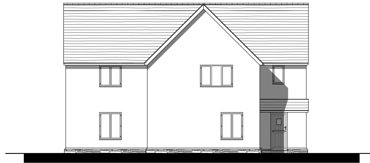
SIDE (WEST) ELEVATION