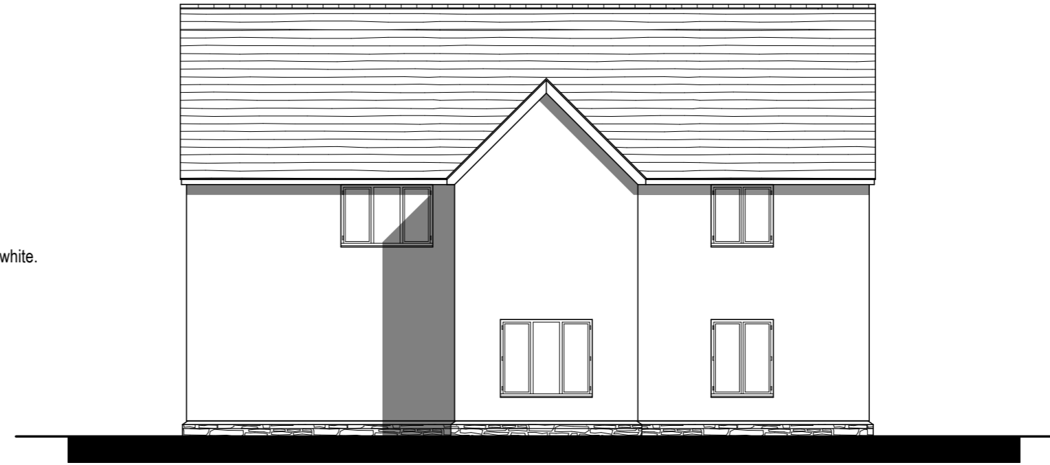
SIDE (EAST) ELEVATION