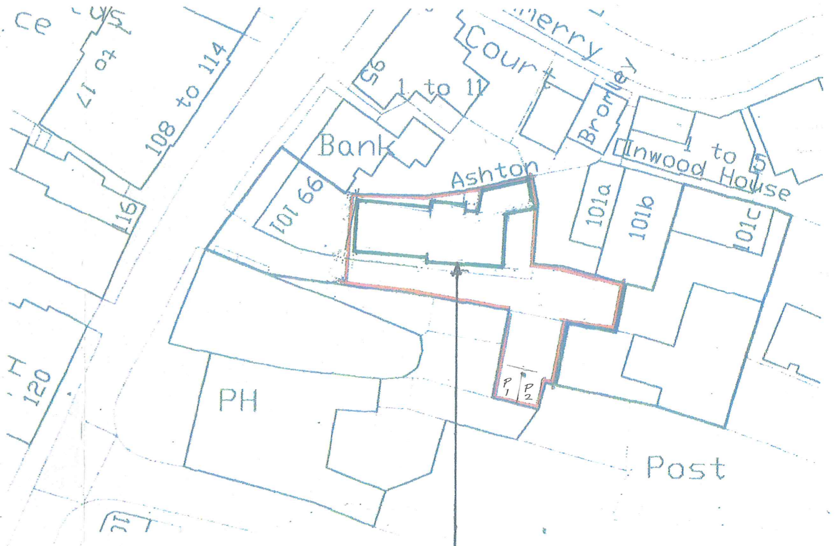
Footprint of block 1 As Approved as SY/18/00951/FUL (no change)