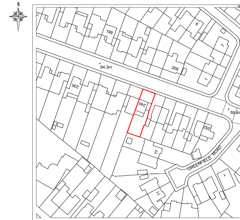
LOCATION PLAN SCALE 1:1250 @ A1 / 1:2500 @ A3