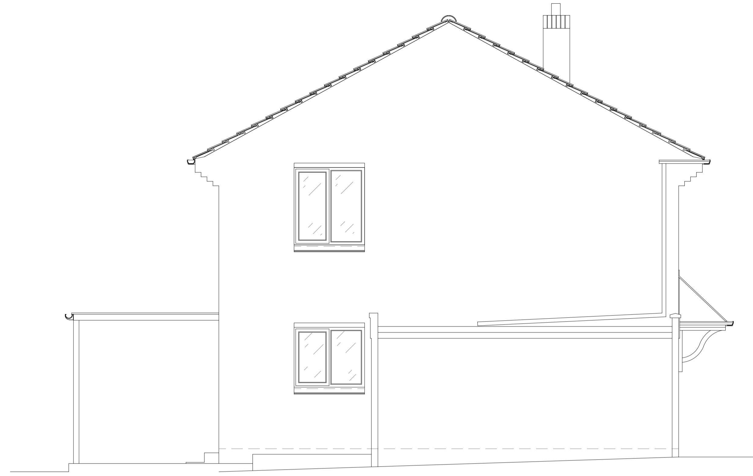
EXISTING SIDE ELEVATION SCALE 1:50 @ A1 / 1:100 @ A3