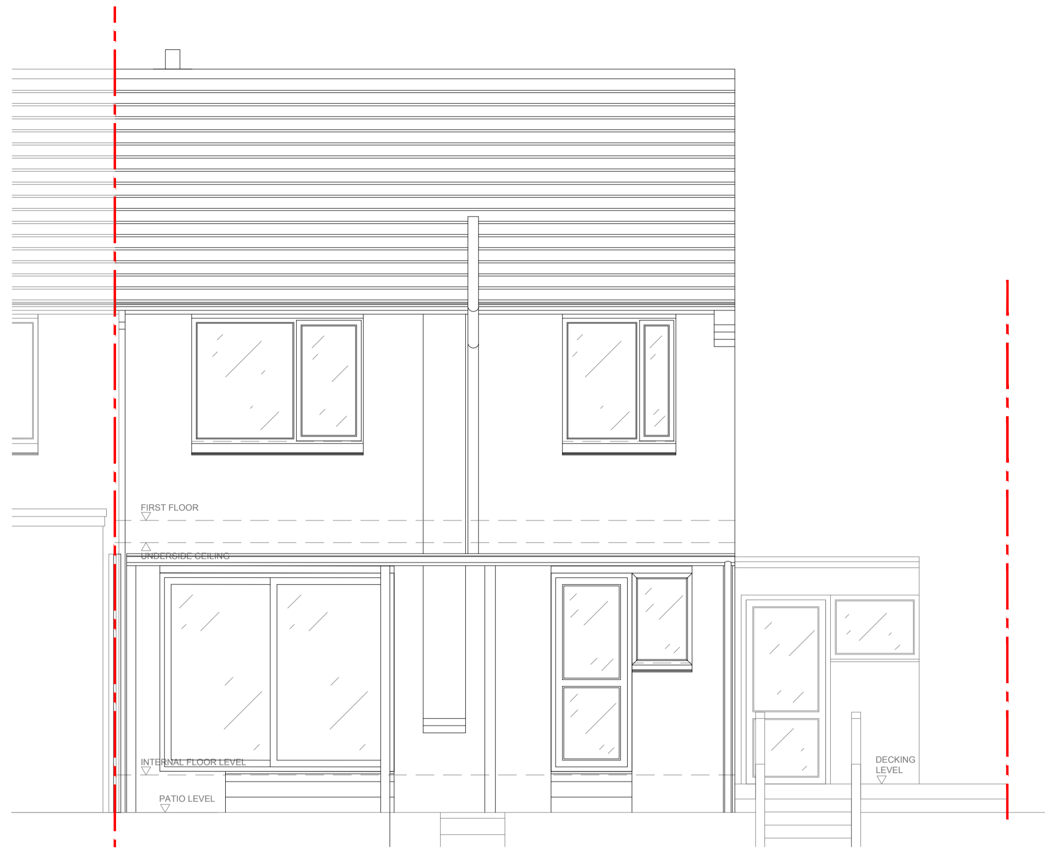
EXISTING REAR ELEVATION SCALE 1:50 @ A1 / 1:100 @ A3