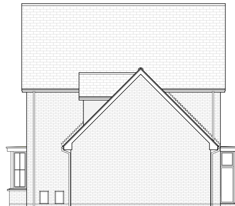
House Type 'O4' Side Elevation 1:100