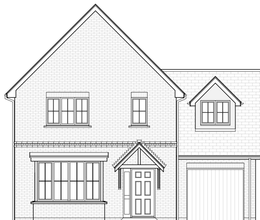
House Type 'O4' Front Elevation 1:100

This drawing must not be scaled. All levels and dimensions must be checked on site, figured dimensions must be checked on site, figured dimensions should be taken in preference to scaled dimensions. Scheme design based on receipt of Third Party Topographical Digital Survey information.