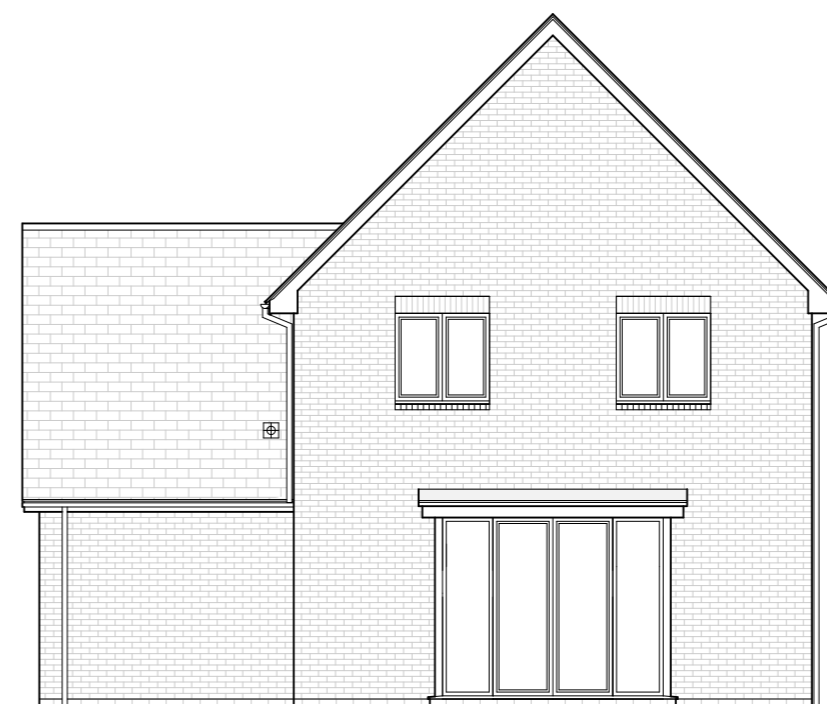
House Type 'O4' Rear Elevation 1:100