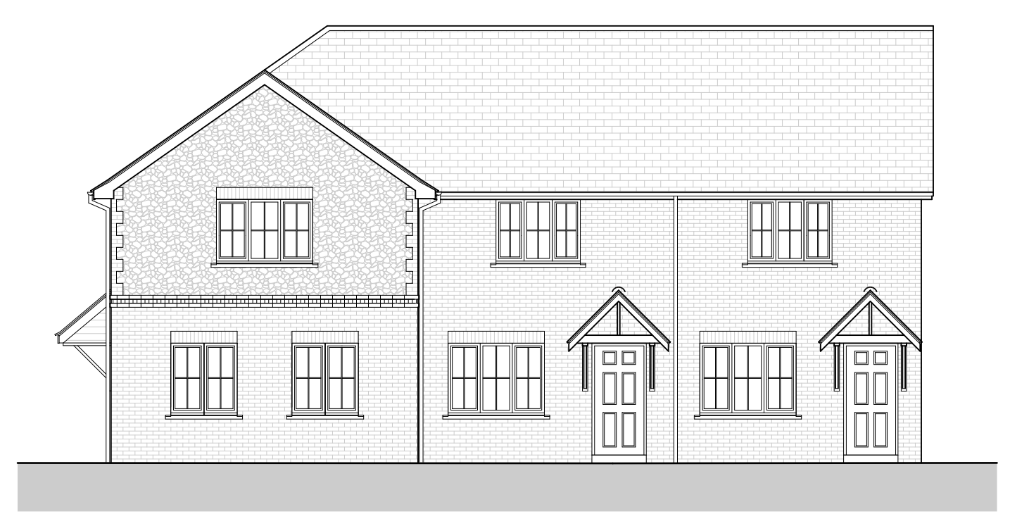
House Types 'A' & 'N' Front Elevation 1:100