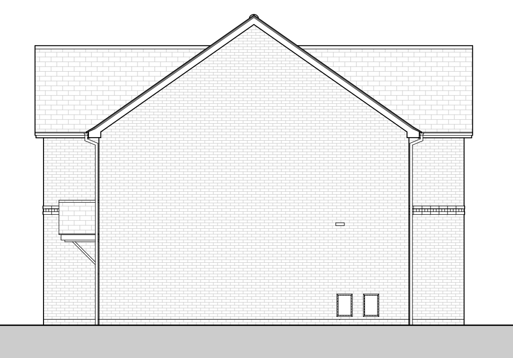
House Types 'A' & 'N' Side Elevation 1:100