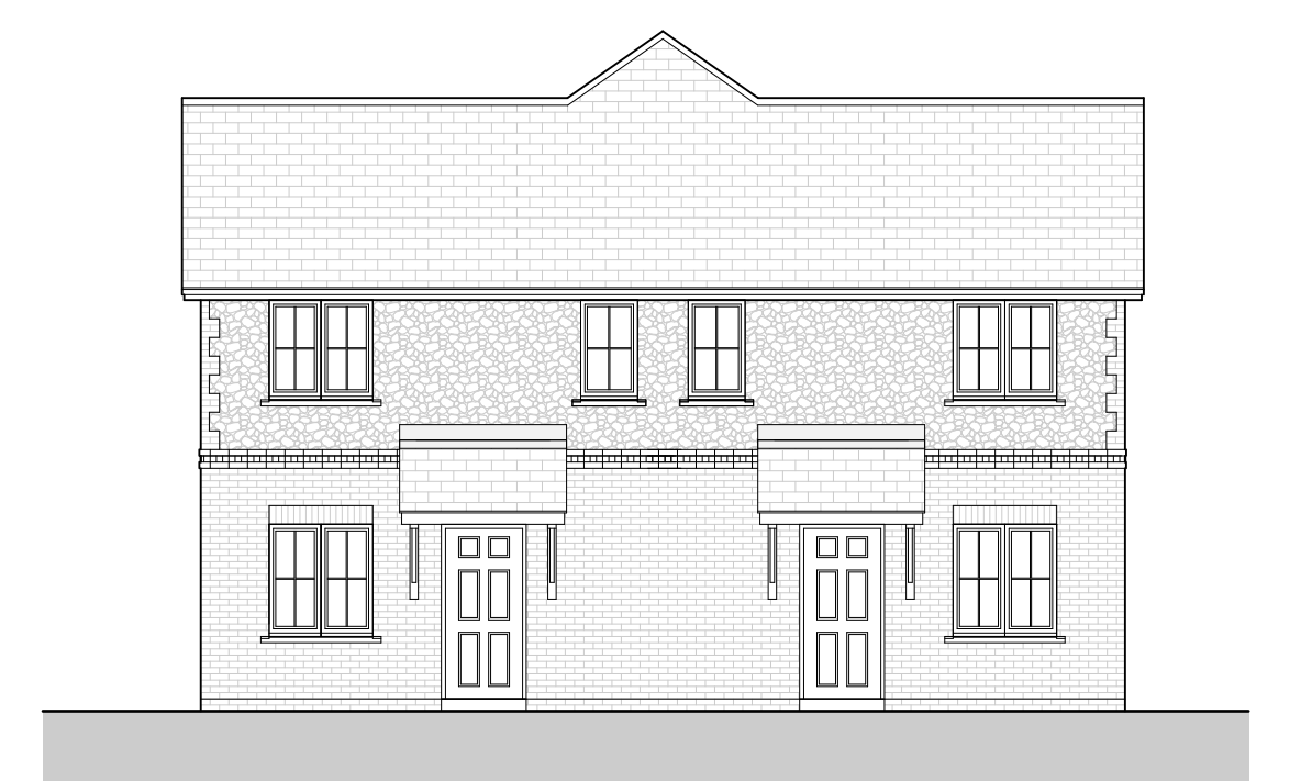
House Types 'A' & 'N' Side Elevation 1:100