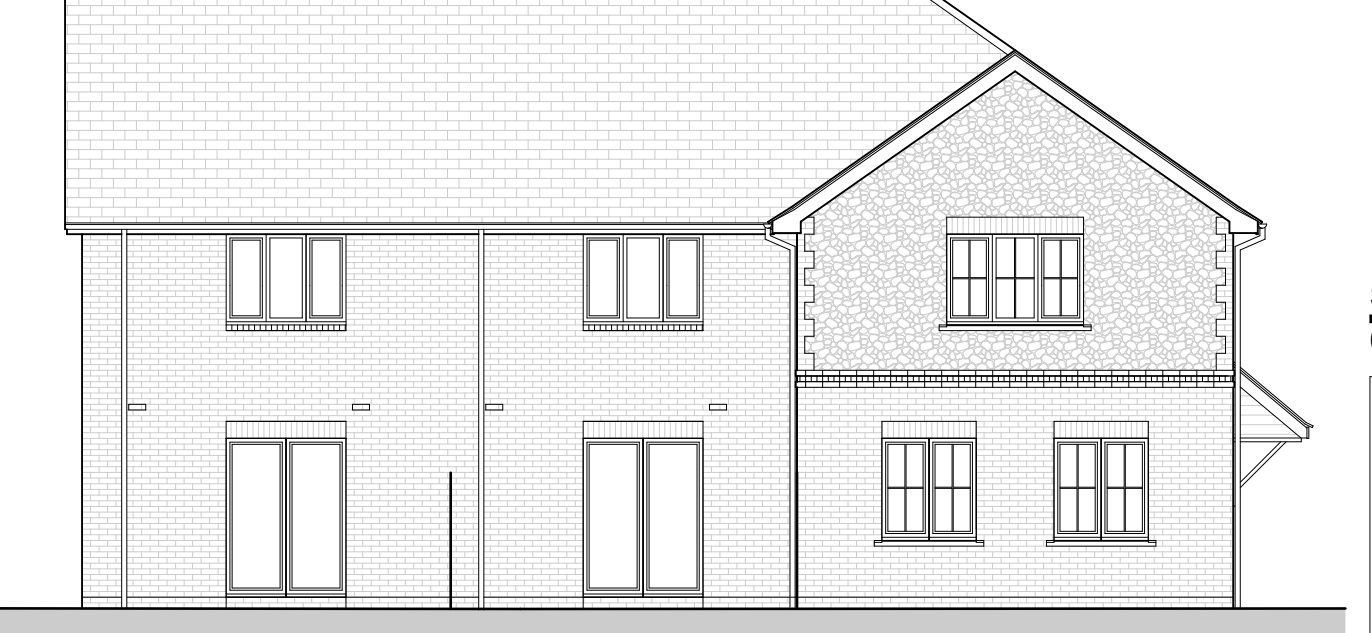
House Types 'A' & 'N' Rear Elevation 1:100