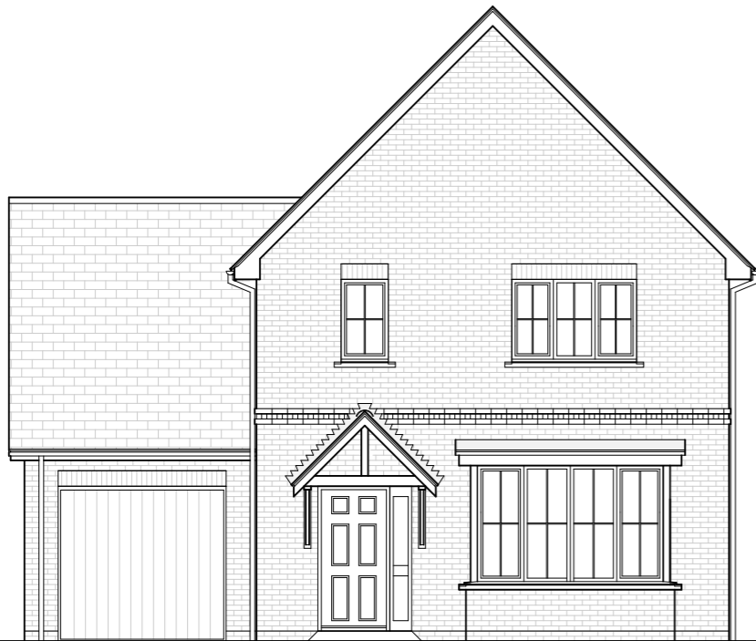
House Type 'O3' Front Elevation 1:100

This drawing must not be scaled. All levels and dimensions must be checked on site, figured dimensions must be checked on site, figured dimensions should be taken in preference to scaled dimensions. Scheme design based on receipt of Third Party Topographical Digital Survey information.