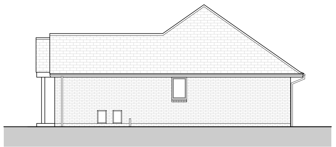
House Type 'L' Side Elevation 1:100