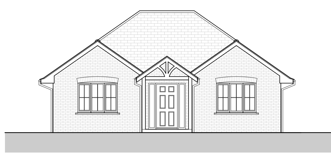
House Type 'L' Front Elevation 1:100