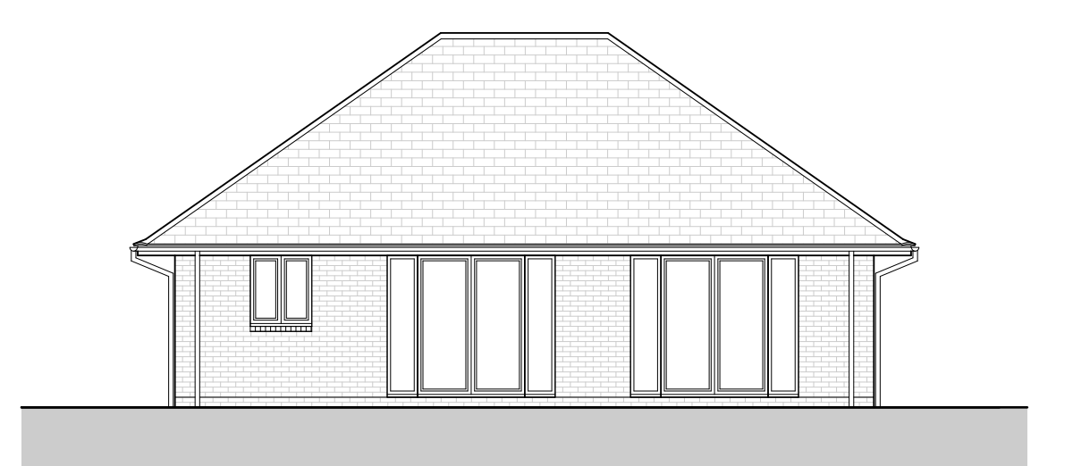
House Type 'L' Rear Elevation 1:100