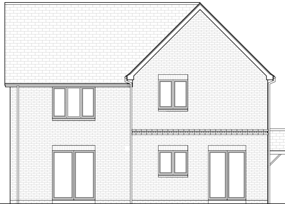
House Types 'P' & 'R' Rear Elevation 1:100