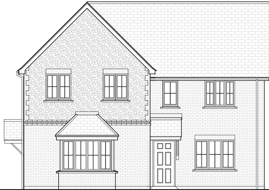
House Types 'P' & 'R' Front Elevation 1:100

This drawing must not be scaled. All levels and dimensions must be checked on site, figured dimensions must be checked on site, figured dimensions should be taken in preference to scaled dimensions. Scheme design based on receipt of Third Party Topographical Digital Survey information.