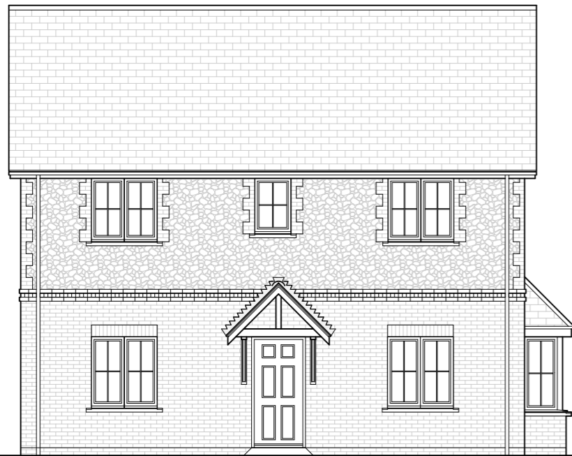
House Types 'P' & 'R' Side Elevation 1:100