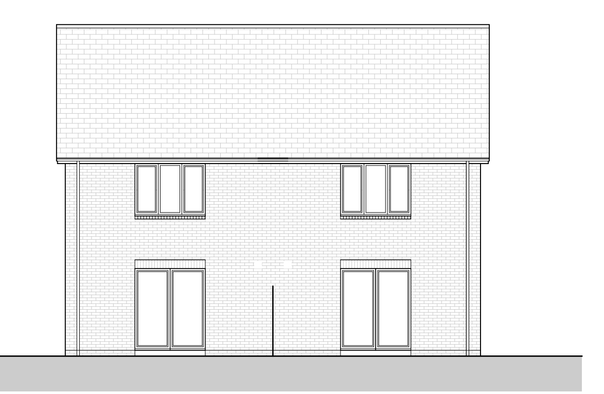
House Types 'R' Rear Elevation 1:100