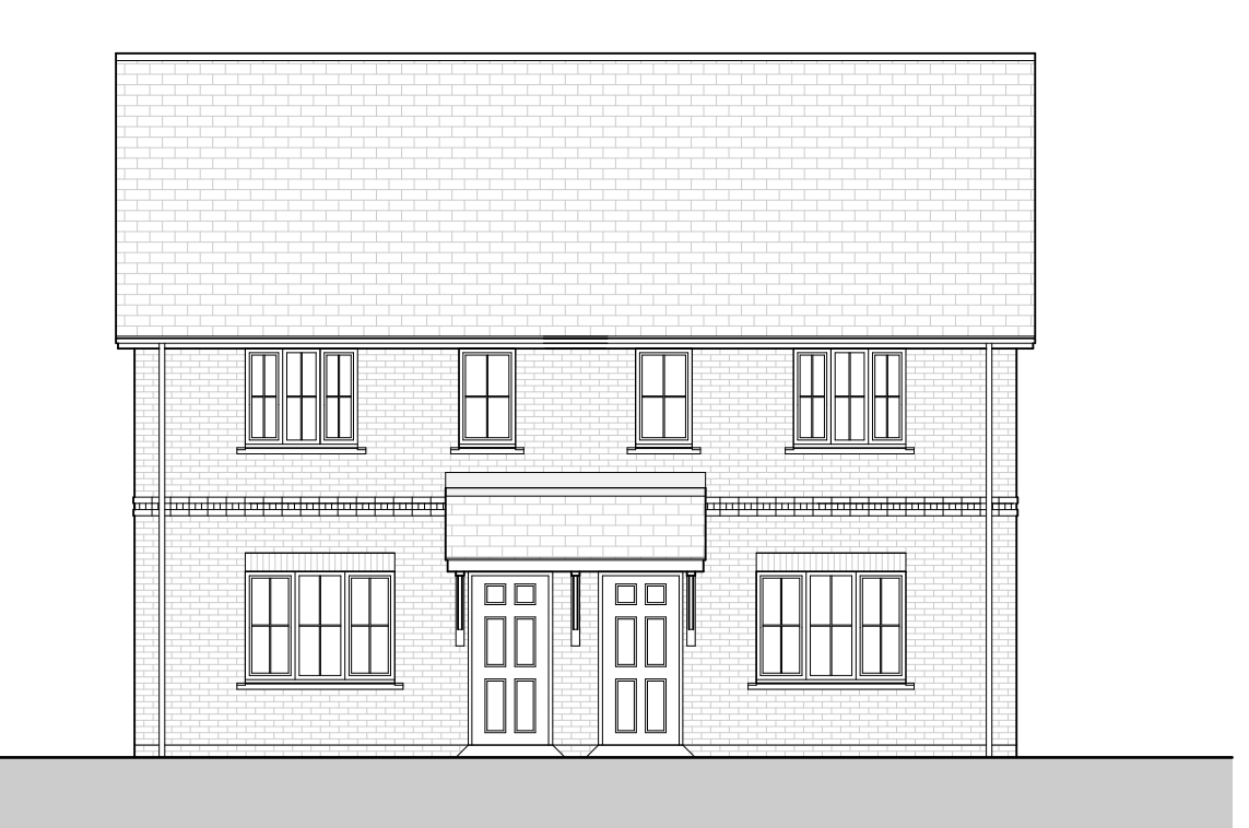
House Types 'R' Front Elevation 1:100