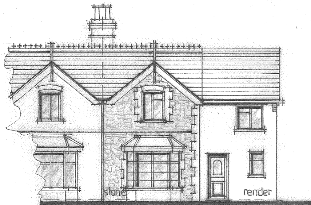
front elevation - existing