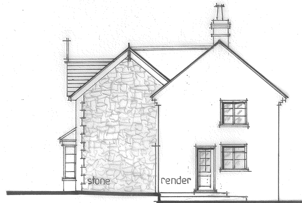
side elevation - existing