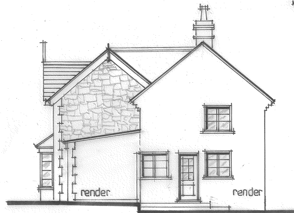
side elevation - proposed