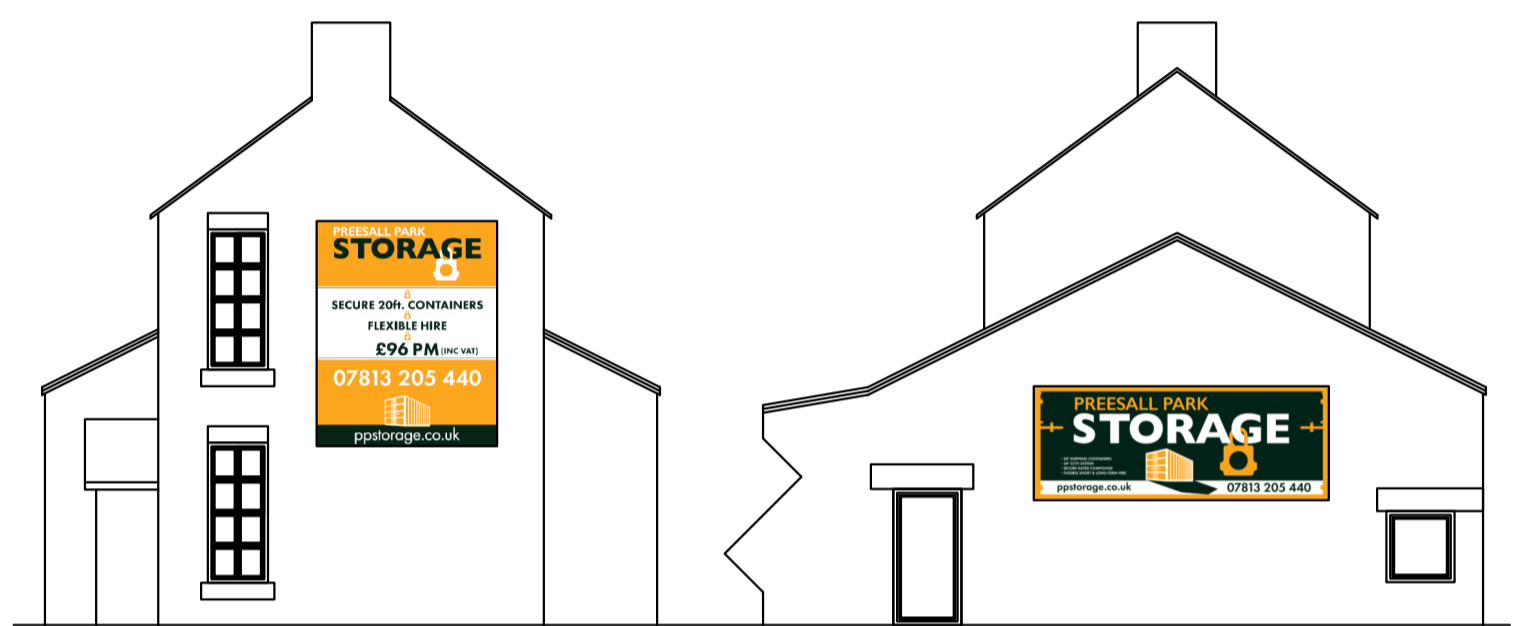
NORTH FACING ELEVATION