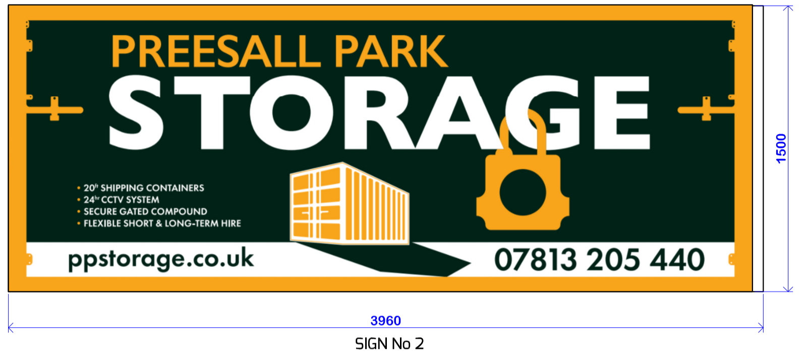
SIGN No 2