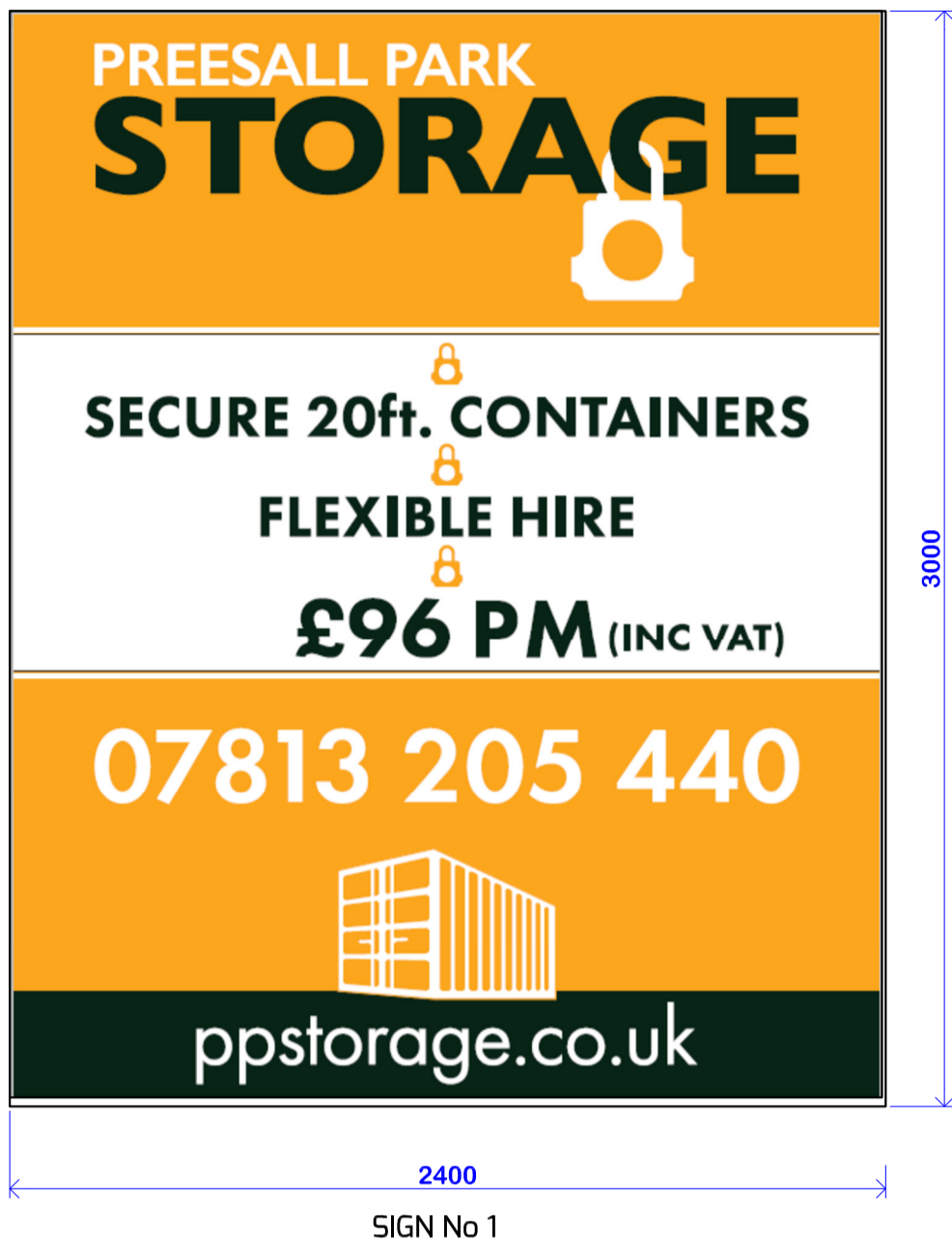
SIGN No 1