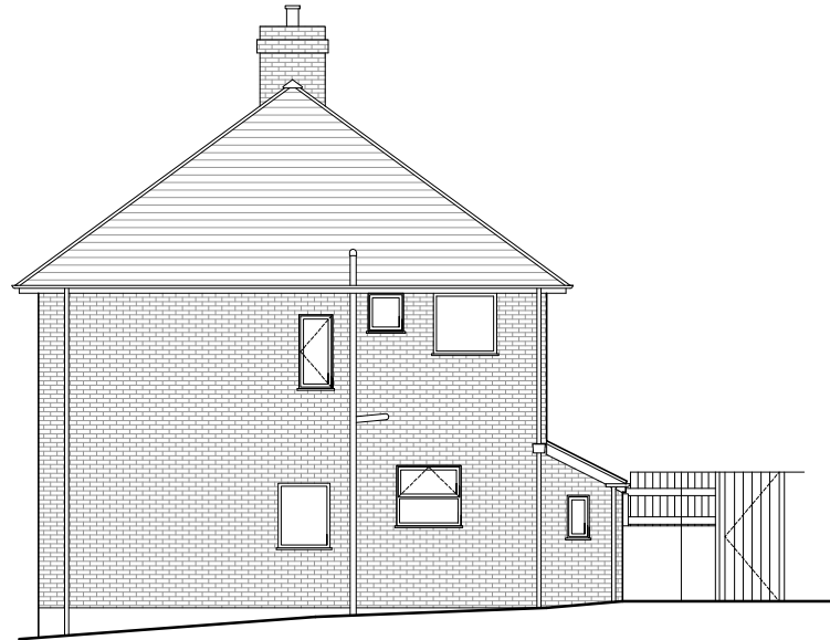
02 Existing South Elevation Scale 1:100