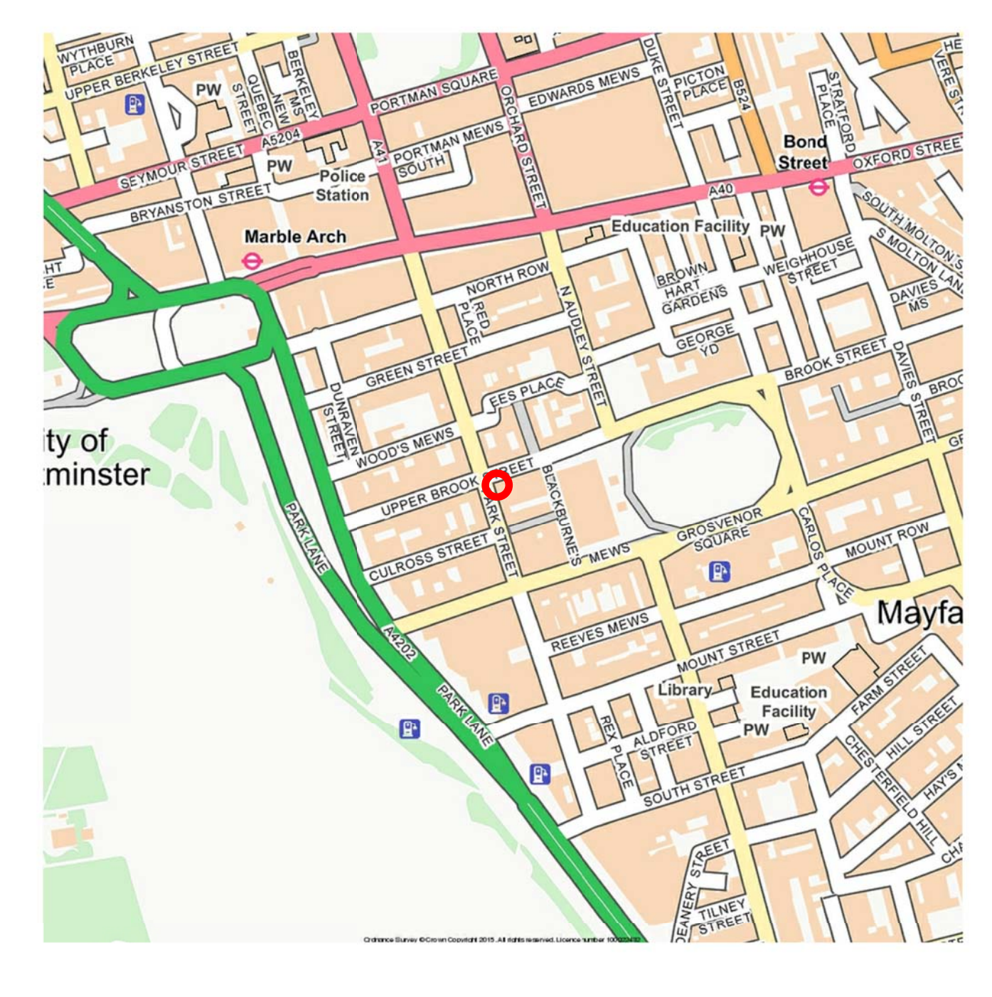
not to scale

These drawings are for use in the planning process only. All measurements should be checked on site. These plans should not be used for structural calculations or any other engineering purpose.