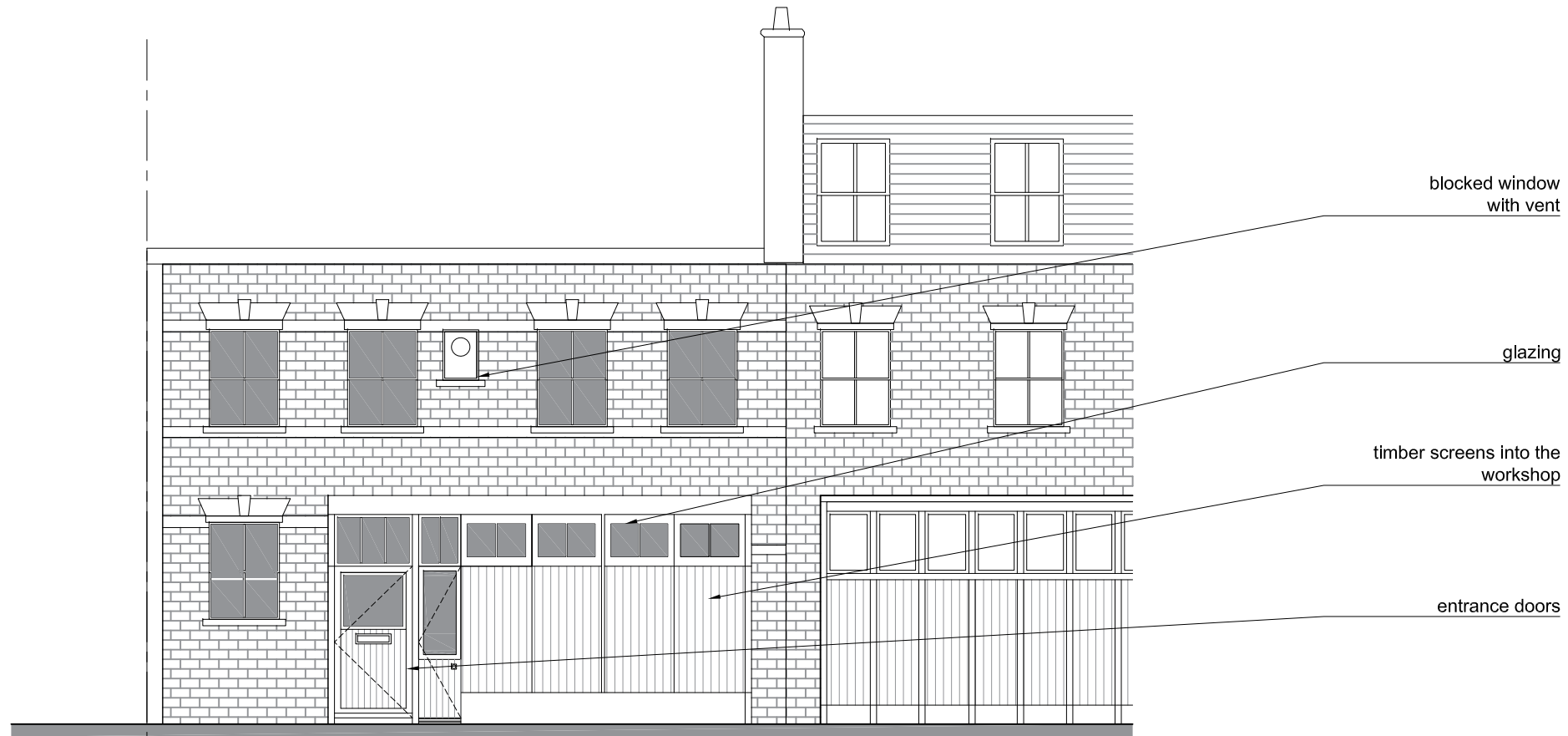
01 Existing Mews Elevation Scale 1:100