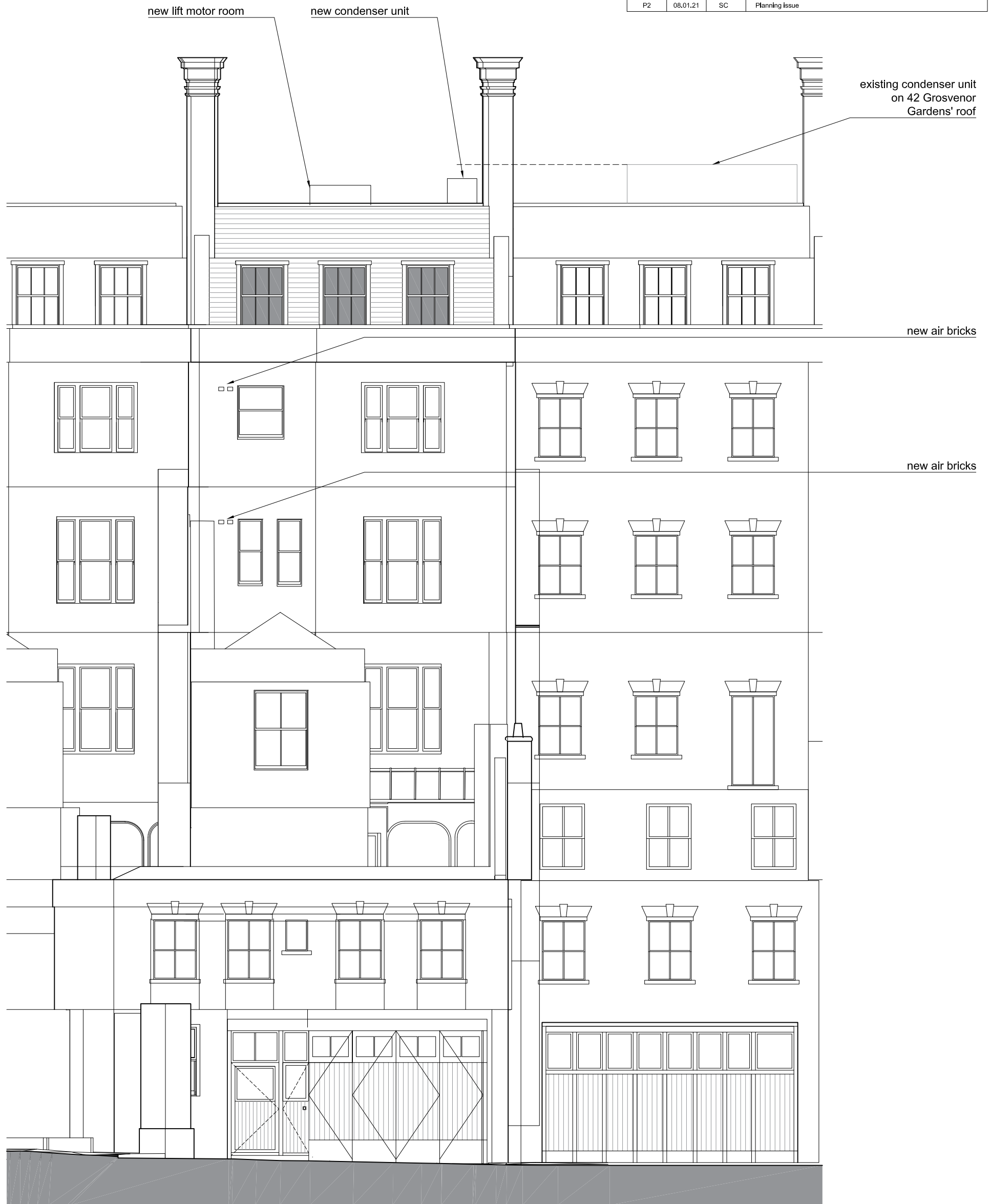
Rear 38 Grosvenor Gardens