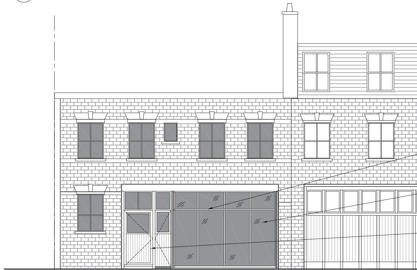
01 Proposed Mews Elevation - Closed Sreens Scale 1:100

new glazing behind coach door coach door panels stacked to reveal glazing new doors