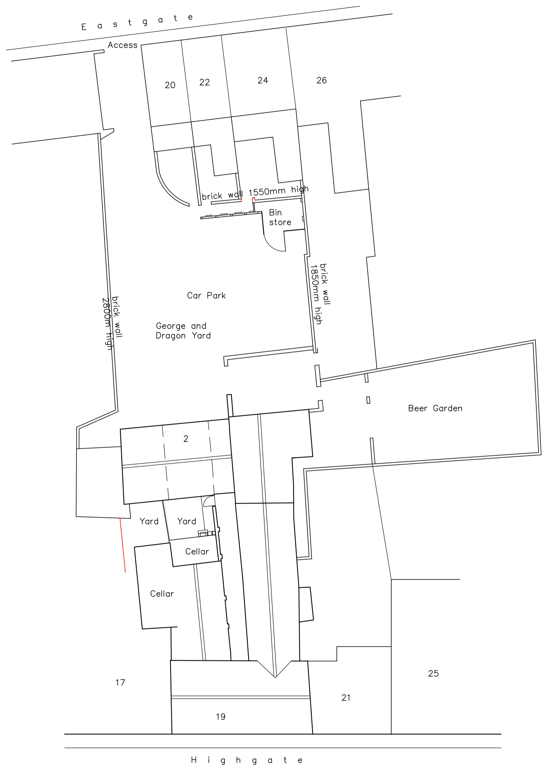
Proposed Site Layout Scale 1:200

All Dimensions Shall be Checked on Site by the Contractor Prior to Commencement of Work on Site. Do Not Scale If in Doubt Ask.