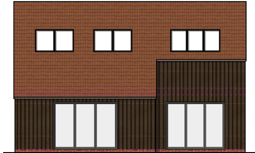
East Elevation (Front)

-B 16.07.20 - HD - HP Juliet balcony added to west elevation.