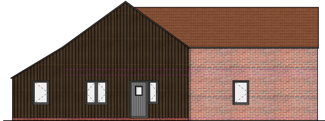
North Elevation (Side)