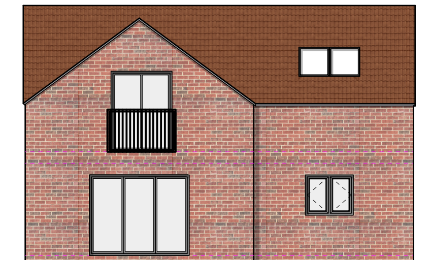
West Elevation (Rear)