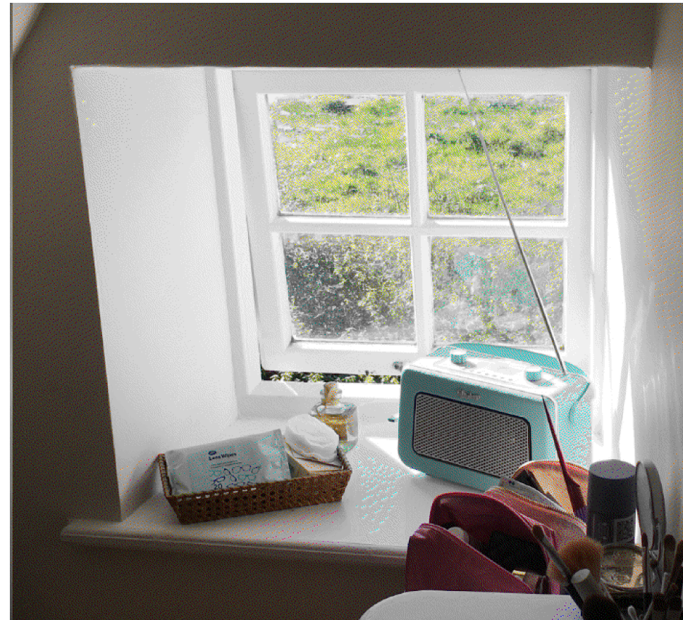
Example of an existing type C window Modern casement window