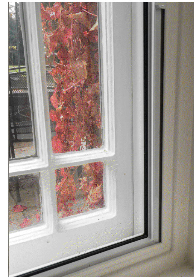
Example of proposed secondary glazing