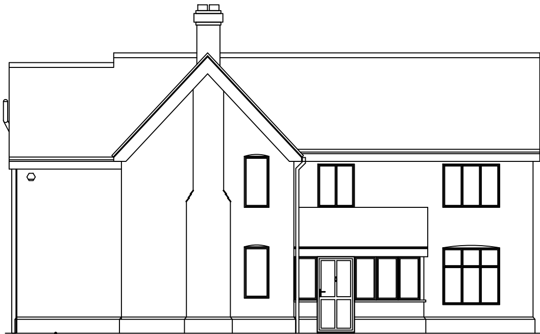
Proposed Elevation B