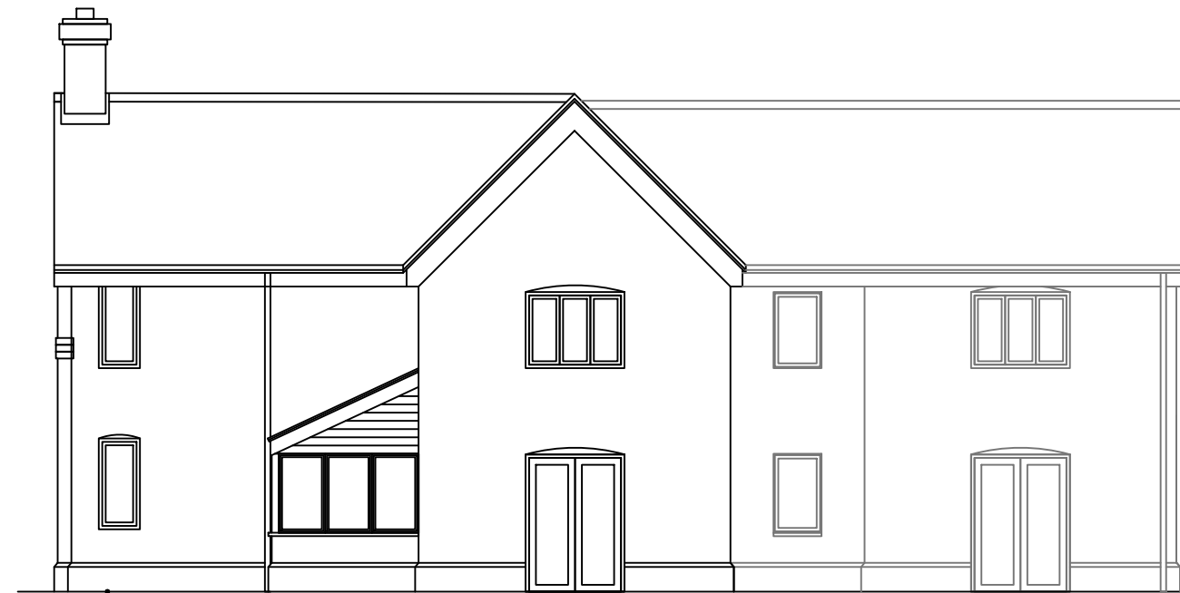
Proposed Elevation A (Road View)