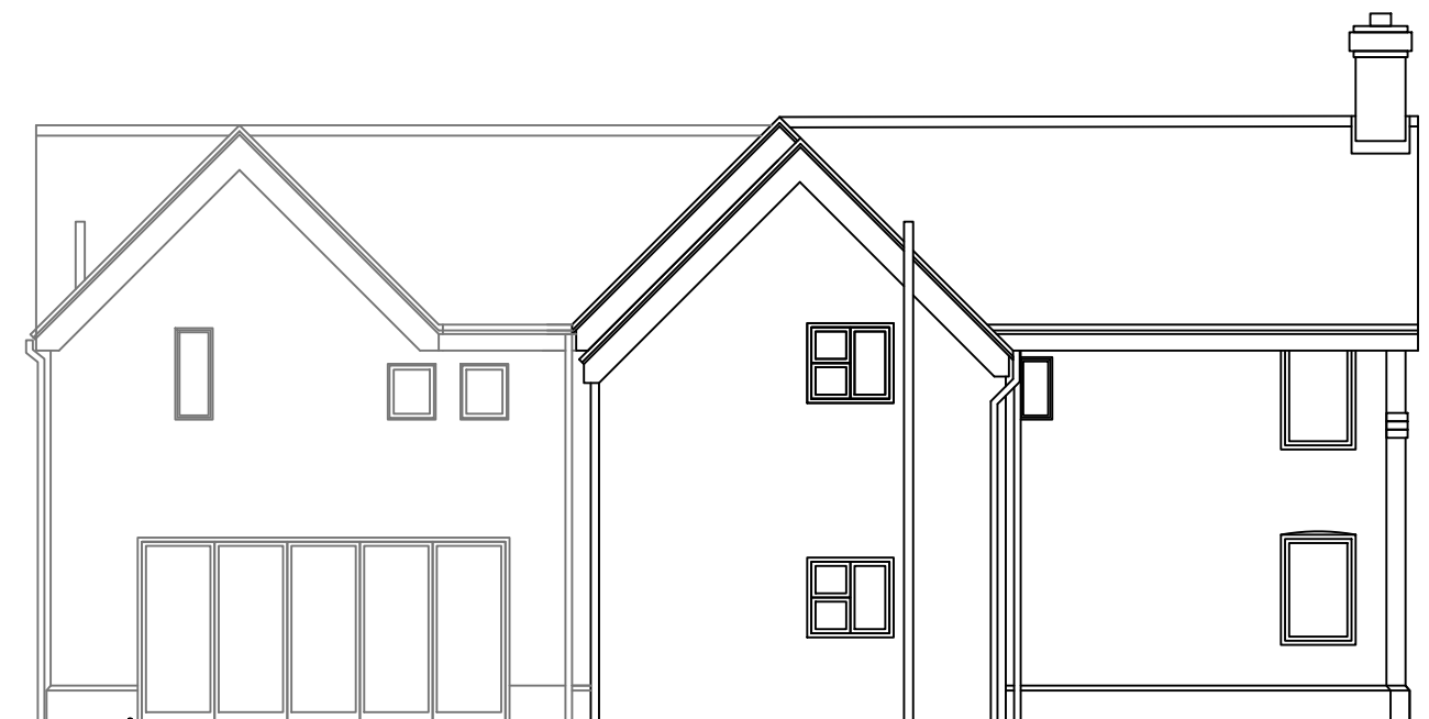
Proposed Elevation C