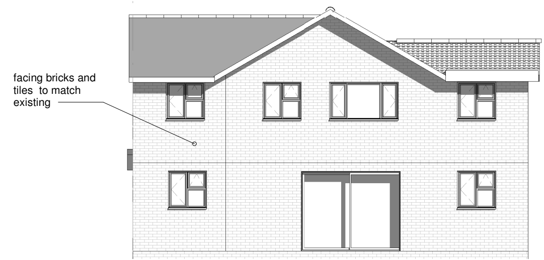
6 Proposed Rear Elevation 1 : 100