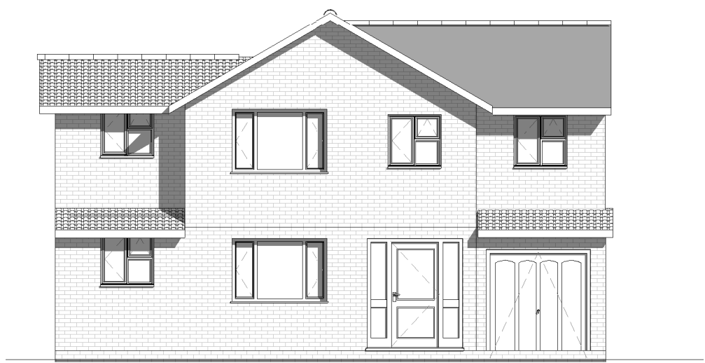
4 Proposed Front Elevation 1 : 100