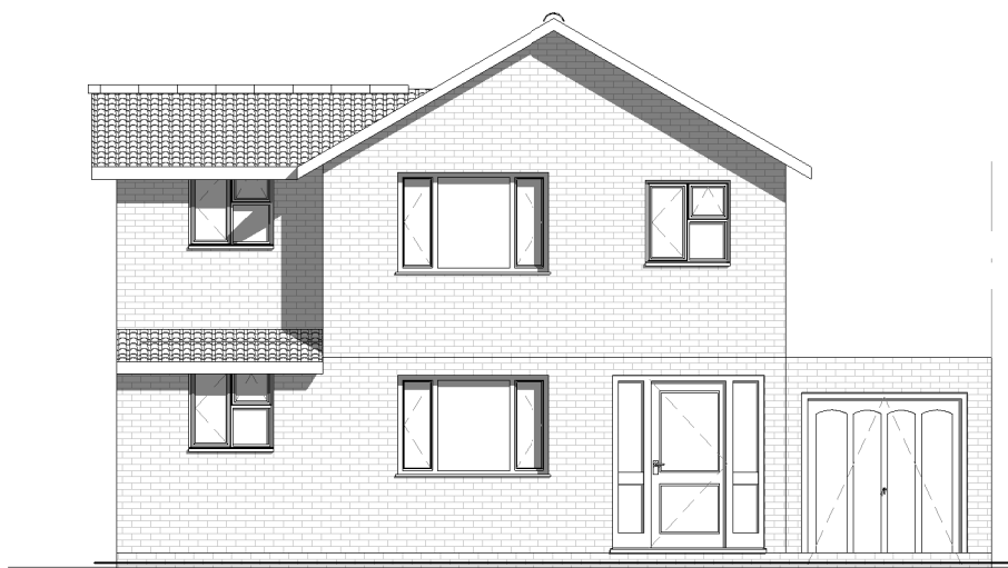
1 Existing Front Elevation 1 : 100