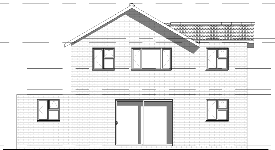
3 Existing Rear Elevation 1 : 100