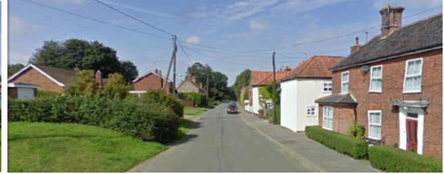
The Street west of Raynham Road (Conservation Area)