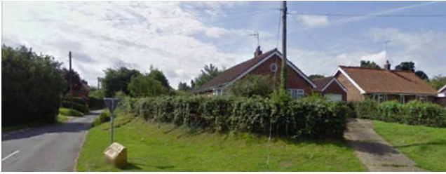
Junction with Raynham Road