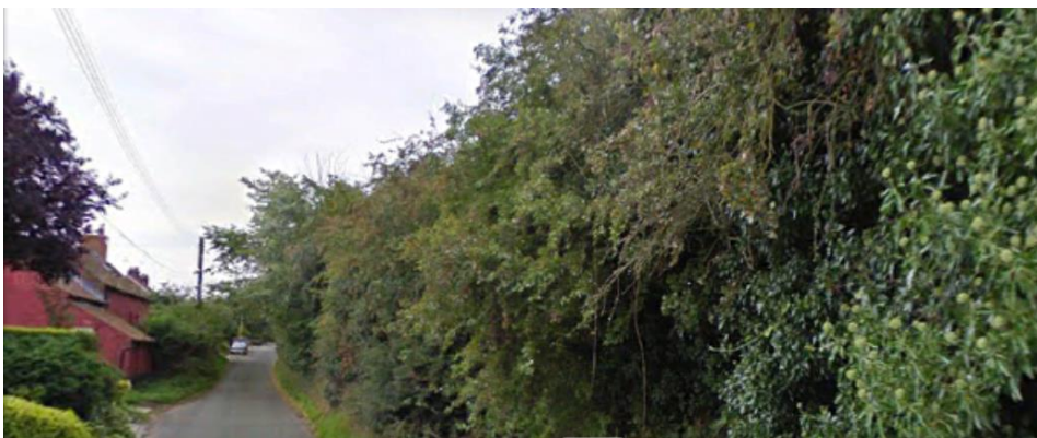
West side of Raynham Road (Conservation Area boundary follows the hedge on the right)