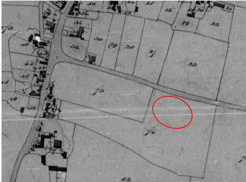
Tithe Map 1840 with application site in red