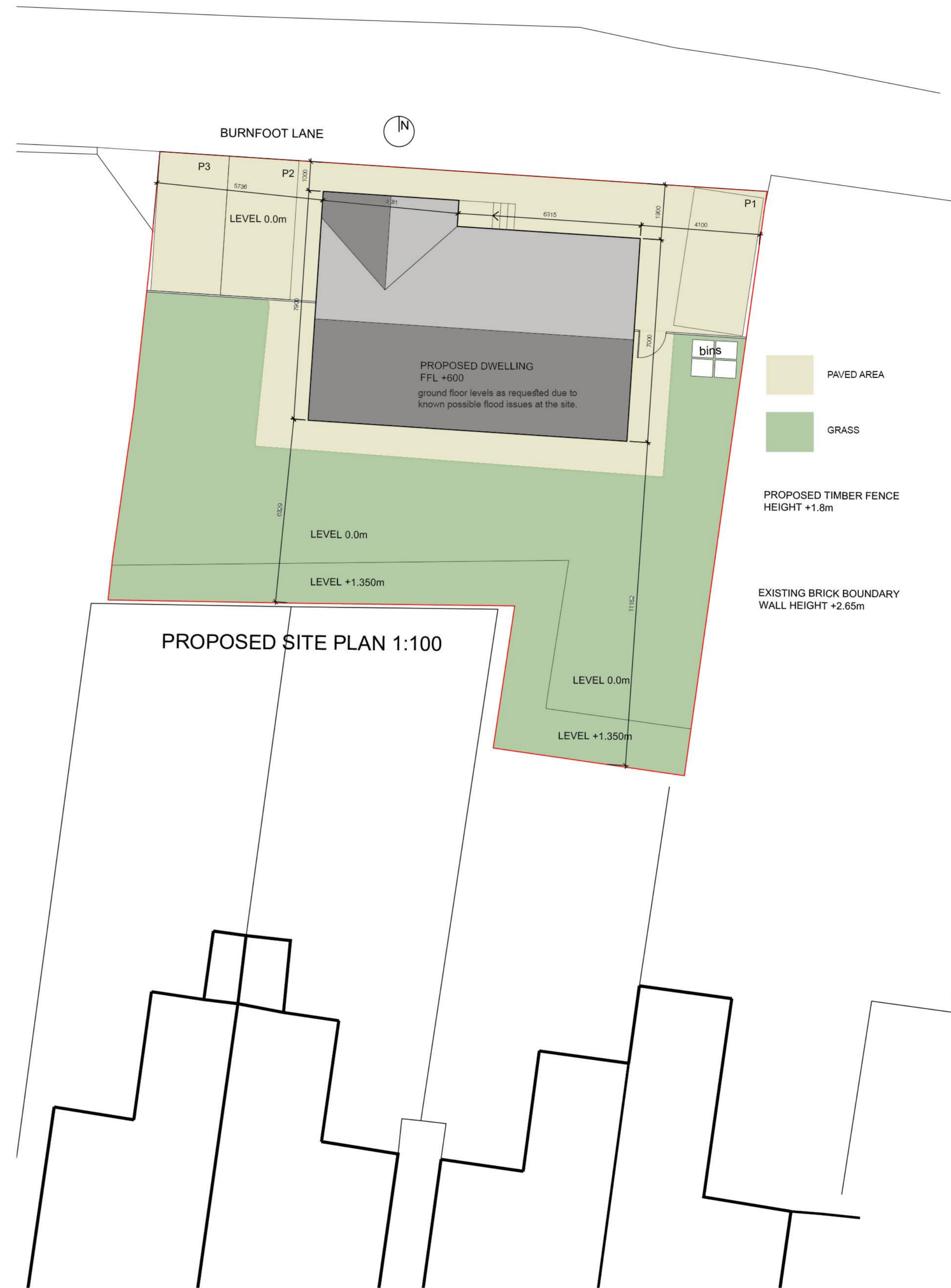
PROPOSED SITE PLAN 1:100