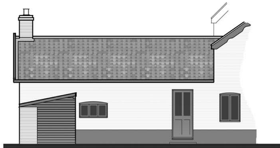
:: North :: Existing :: 1:100 ::