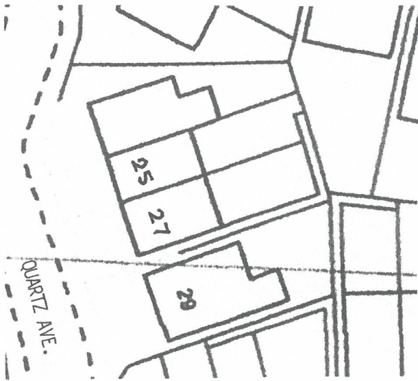
EXG. SITE PLAN 1:500