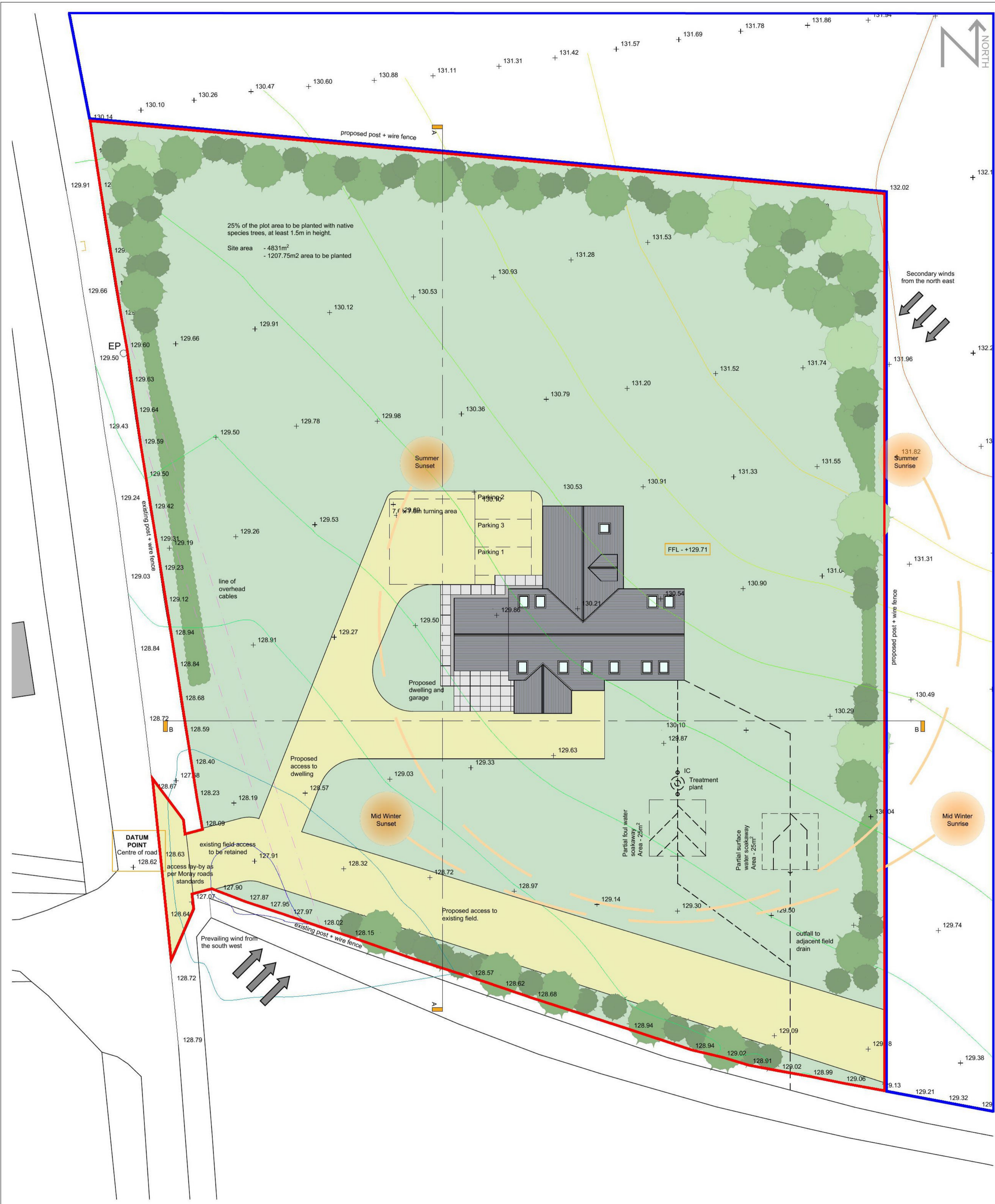
Site Plan Scale 1:200