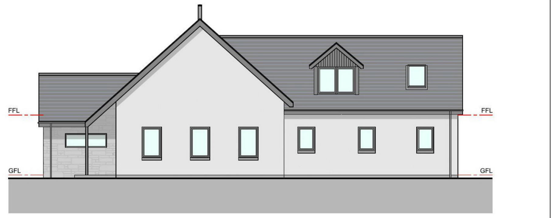
Proposed East Elevation Scale 1:100