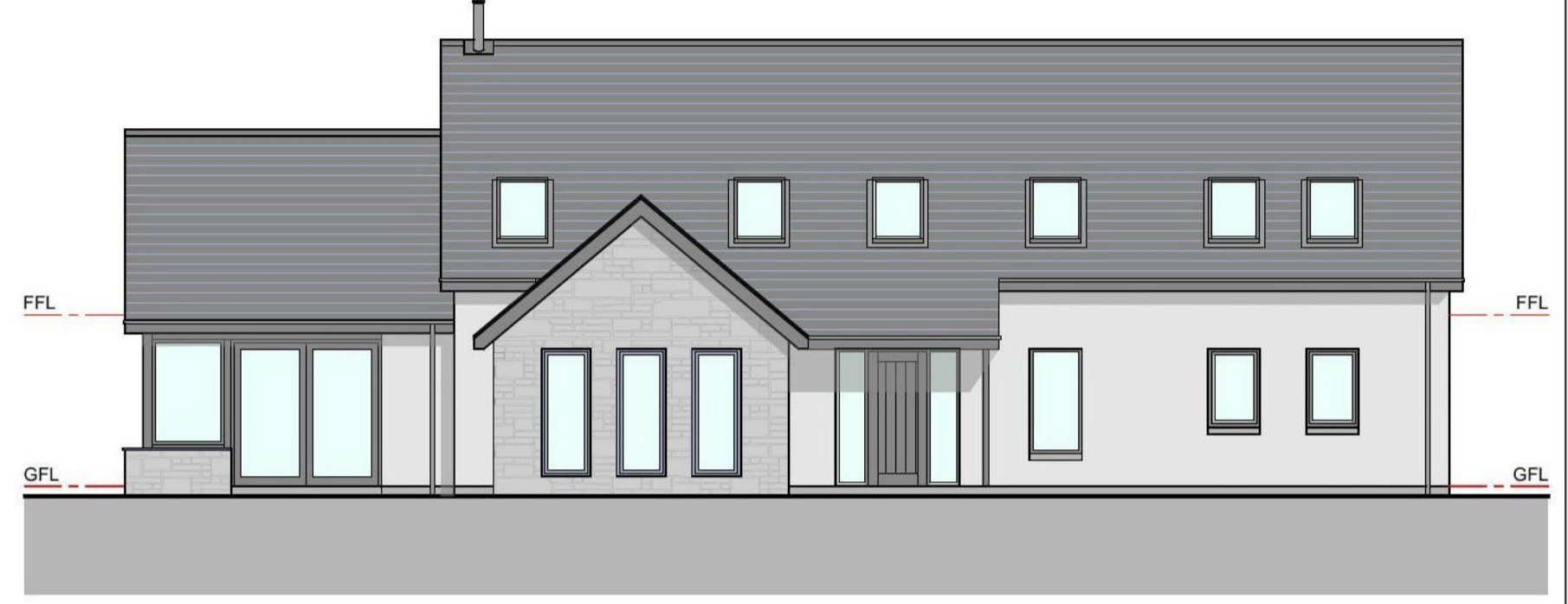
Proposed South Elevation Scale 1:100