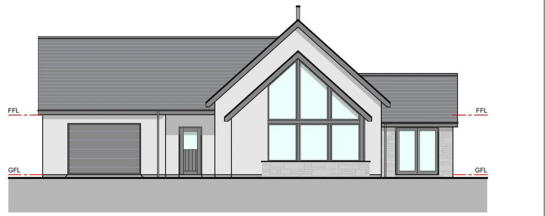
Proposed West Elevation Scale 1:100