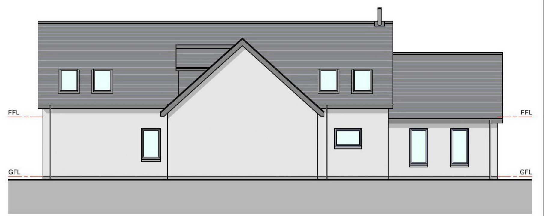
Proposed North Elevation Scale 1:100