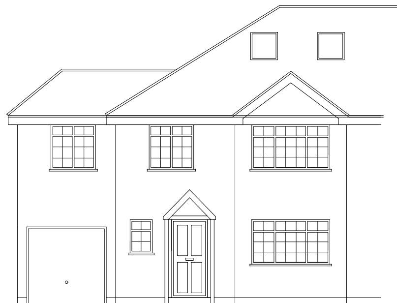
Proposed Front Elevation 1:100