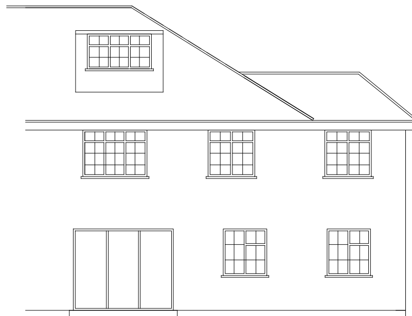
Proposed Rear Elevation 1:100