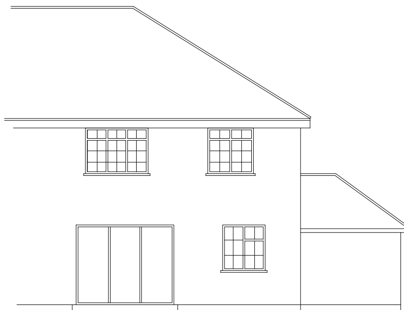
Existing Rear Elevation 1:100