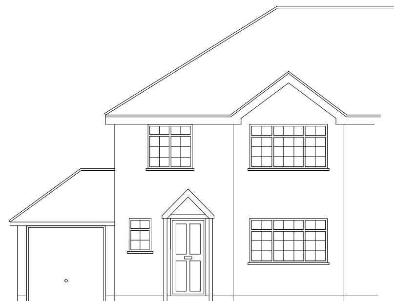
Existing Front Elevation 1:100