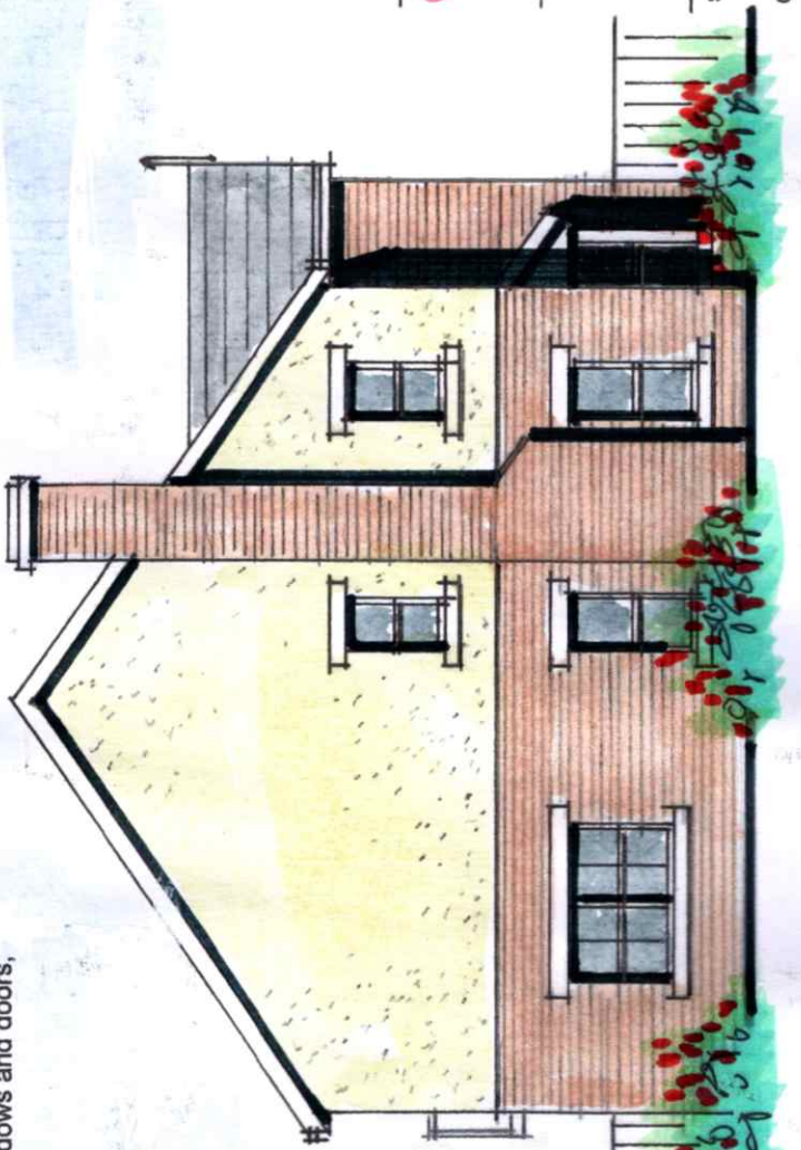
Side Elevation to New House Farm