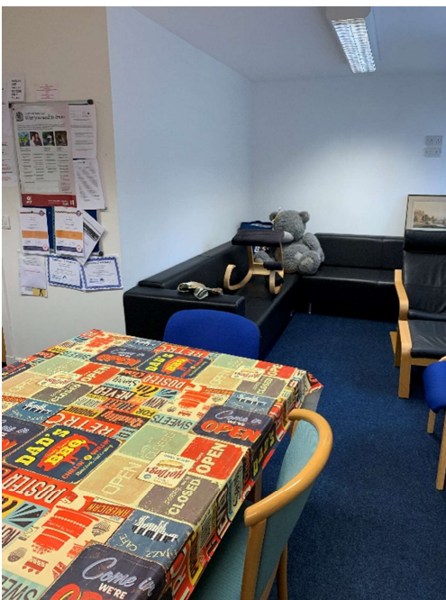
Office no. 12