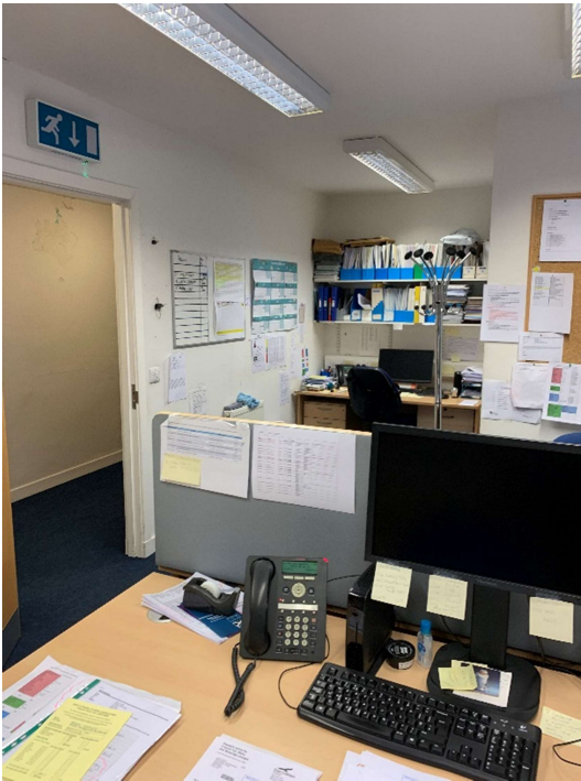
Office no. 06