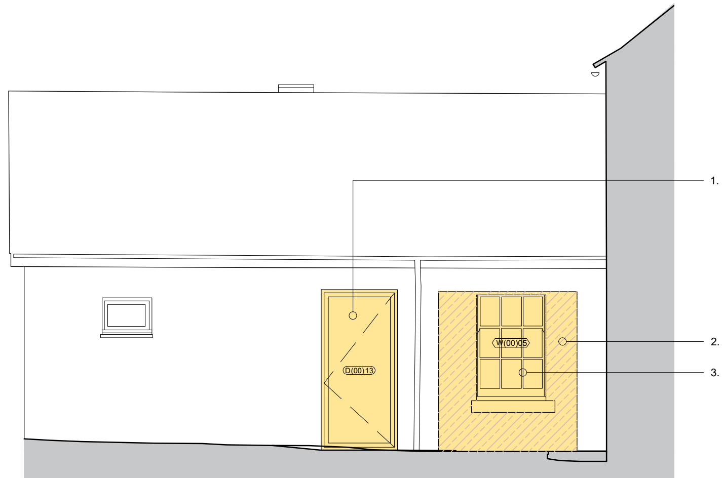
03 Proposed Elevation - West - New Entrance Doors to Existing Building 1:50