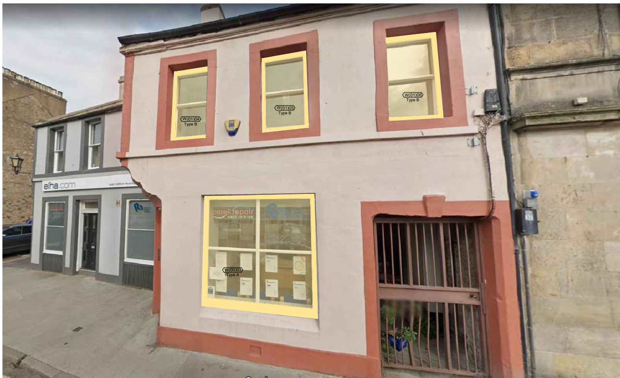
02 Proposed Elevation - South - New Slimlite Windows NTS