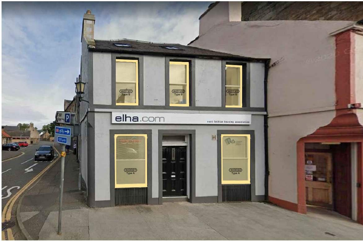
01 Proposed Elevation - South 1 - New Slimlite Windows NTS

NOTES 1. New external double glazed VELFAC door - white. Glass to be designed to resist human impact as per BS 6262: Part 4: 2005. Max U value 1.6W/m²K 2. Render to match adjacent. 3. New timber sash and case window to match existing windows, painted white.